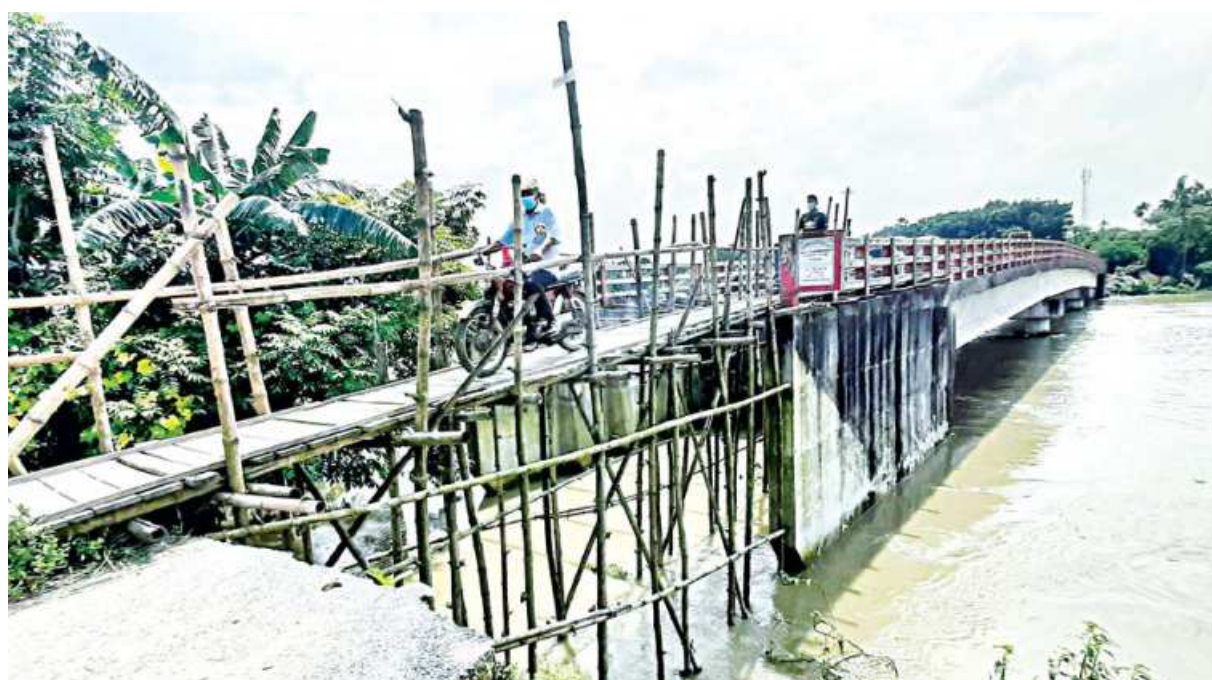
Locals in Tangail Sadar upazila's Boro Basalia area have been suffering for 14 long months as the mouth of a bridge over the Louhajang river remains damaged. The bridge leads to a road, which is important for communication in the upazila.