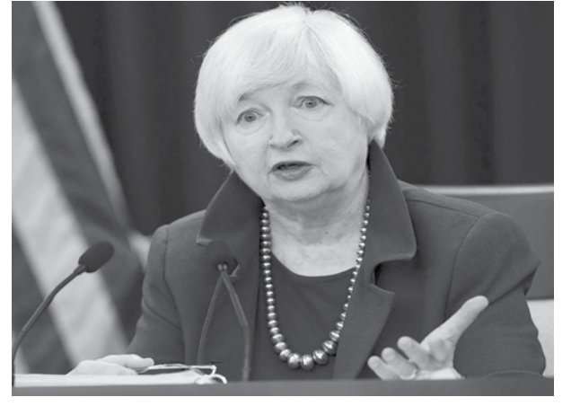
JANET YELLEN US TREASURY SECRETARY

The United States is also working on a reform targeting companies that benefit from tax havens, with the objective of making these companies pay a minimum of 21 per cent