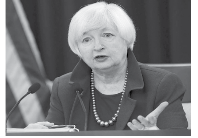
JANET YELLEN US TREASURY SECRETARY

The United States is also working on a reform targeting companies that benefit from tax havens, with the objective of making these companies pay a minimum of 21 per cent