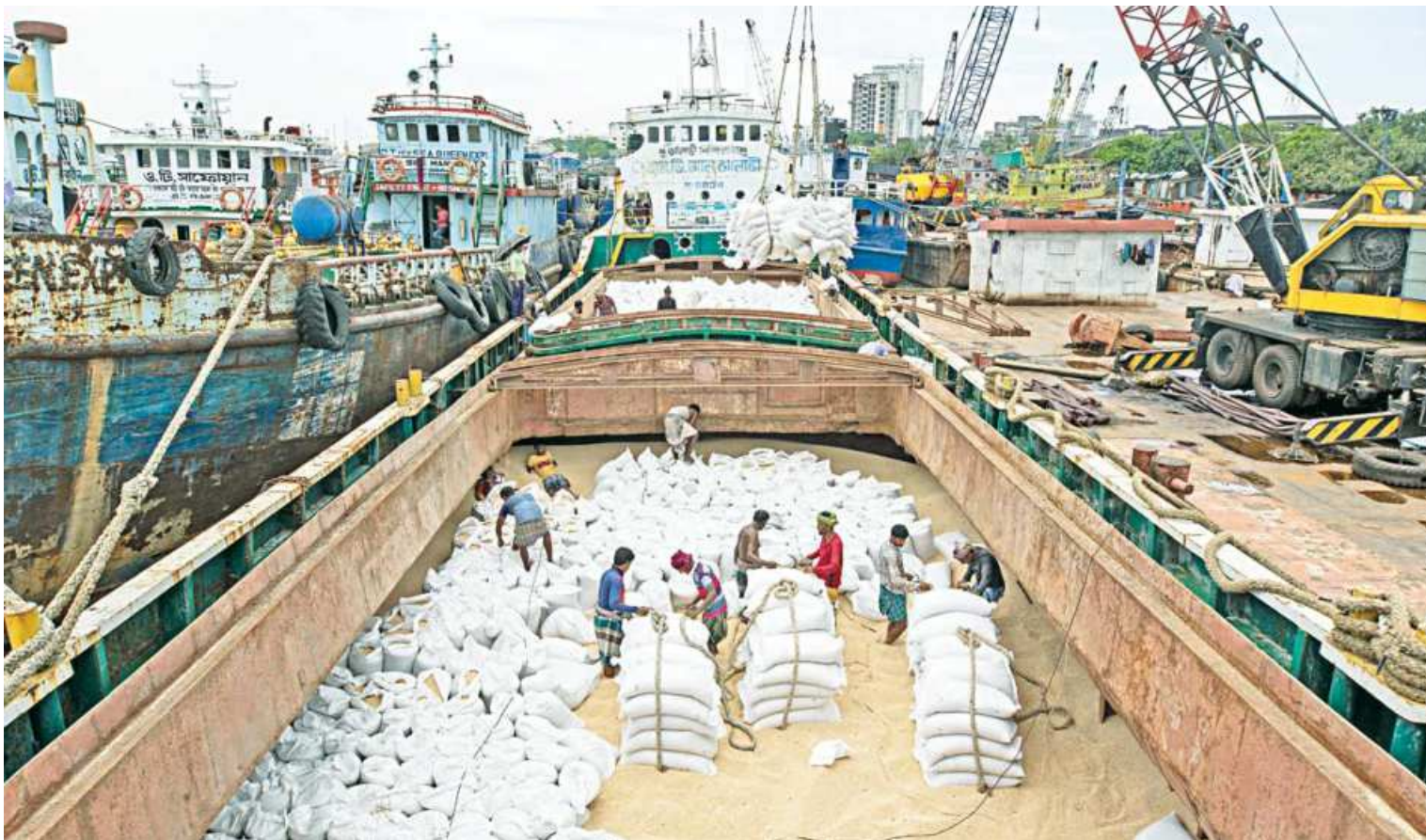
The usual hubbub of stevedores and traffic of goods-laden lighters have made a comeback at Chattogram's 16 private ghats or quays from September 1 after four months of depressed activity, thanks to consensus being reached on charter prices. A prior disagreement had led big businesses to boycott private organisation Water Transport Cell (WTC), which controls some 1,500 of the around 2,200 lighters engaged in transporting cargo from large ships at the Chattogram port's outer anchorage to the 39 landing places around the country. The conglomerates instead opted using around 300 such vessels of their own alongside around 200 non-registered vessels. This had left most of the WTC vessels out of work. The photo was taken at Anu Majhir Ghat recently.