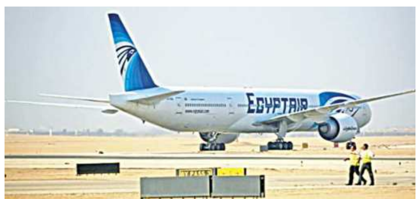
Egyptair, the state-owned airline of Egypt, will initially operate two weekly flights between Dhaka and Cairo.