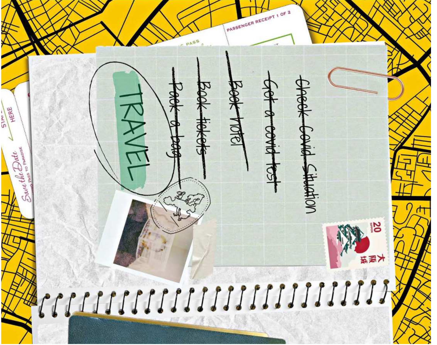
ILLUSTRATION: ZARIF FAIAZ