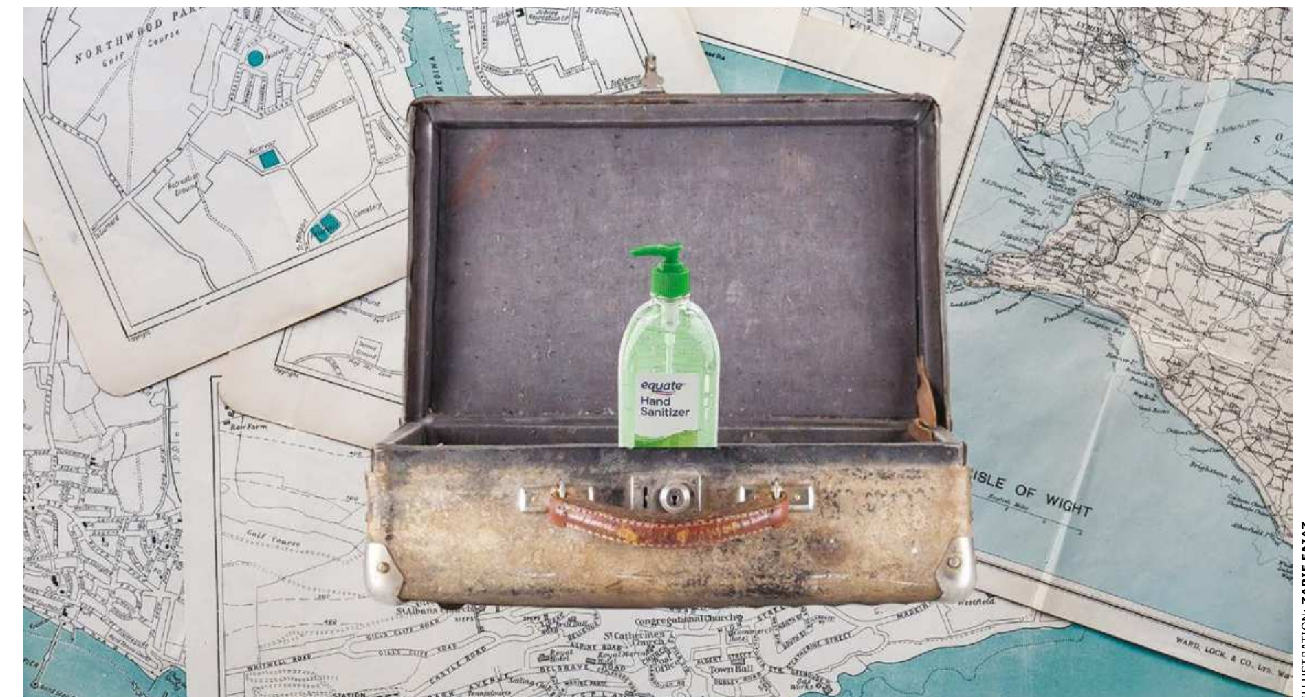
ILLUSTRATION: ZARIF FAIAZ

While reserving a hotel room or checking in, ask the hotel staff if you can get a room that has not been occupied within the last few days. Though hotel staff clean and disinfect rooms after the departure of the customers, keeping the room unoccupied for a few days reduces the possibility of the Covid-19 infection. Disinfect the switches and knobs after reaching there. If possible, select a room on the ground floor to minimise contact with high-touch surfaces such as elevators, handrails or to avoid coming across with more guests and staff. If the hotel or guest house is overcrowded and has poor disinfecting practices, look for an alternative place to stay.