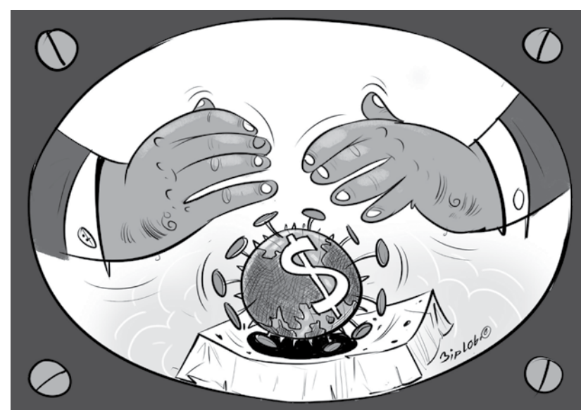
Everyone seems to be an expert on one thing or another these days.