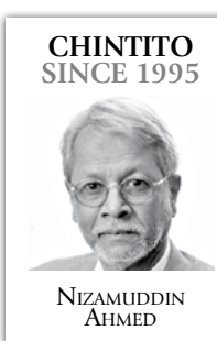
CHINTITO SINCE 1995