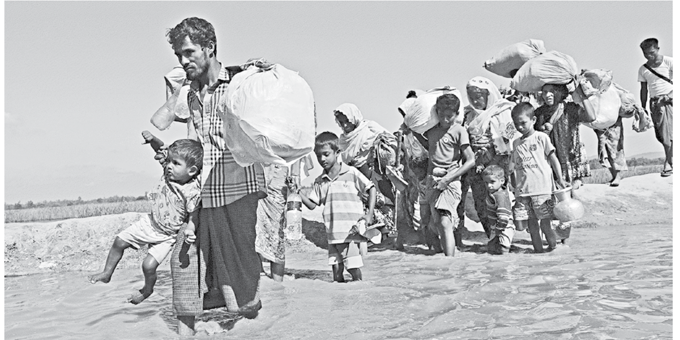
Displacement and poverty are the inevitable results of wars and internal conflicts, and the Rohingyas are a prime example of that.

Let's recall that world leaders once committed to "end poverty in all its forms everywhere" by 2030, and we're just nine years away from that deadline. Interestingly, the SIPRI report said that military expenditure amounted to 2.3 percent of global gross domestic product—and 10 percent of that money would be enough to fund the global goals agreed upon by the United Nations to end poverty