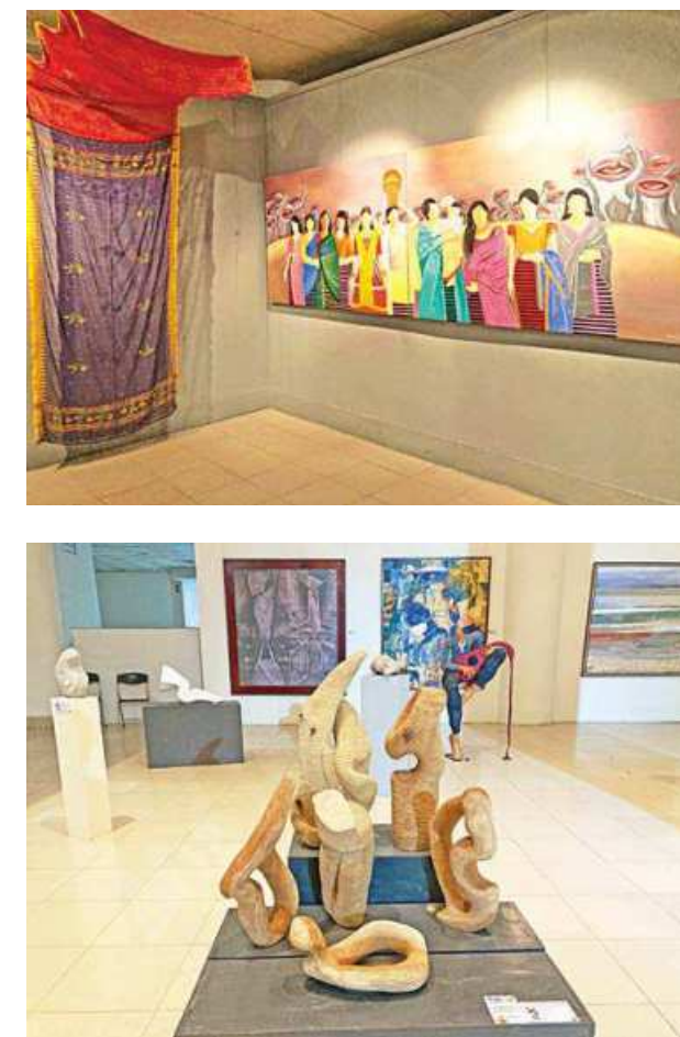
The 24th National Art Exhibition, organised by Bangladesh Shilpakala Academy (BSA), is underway at the academy in the capital's Segunbagicha. The exhibition is featuring 347 artworks of different mediums and genres by 323 artists. Open for all, the event will end on September 15.