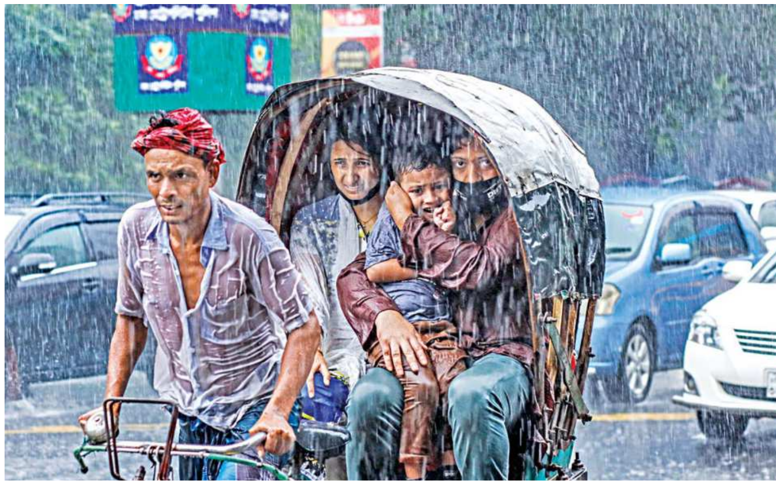
During yesterday's sudden rainfall, this family found itself on a rickshaw at the capital's Dhanmondi Road-27. As thunder blared across the sky, the child got scared and the father cupped his palms over the child's ears to shield him from the noise.