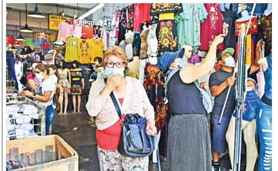
A woman adjusts her face mask while shopping at a clothing store in Los Angeles, California in July.

The analysis, prepared in advance of the Fed's next policy meeting on September 21-22, said contacts in most districts "remained optimistic about near-term prospects, though there continued to be widespread concern about ongoing supply disruptions and resource shortages.