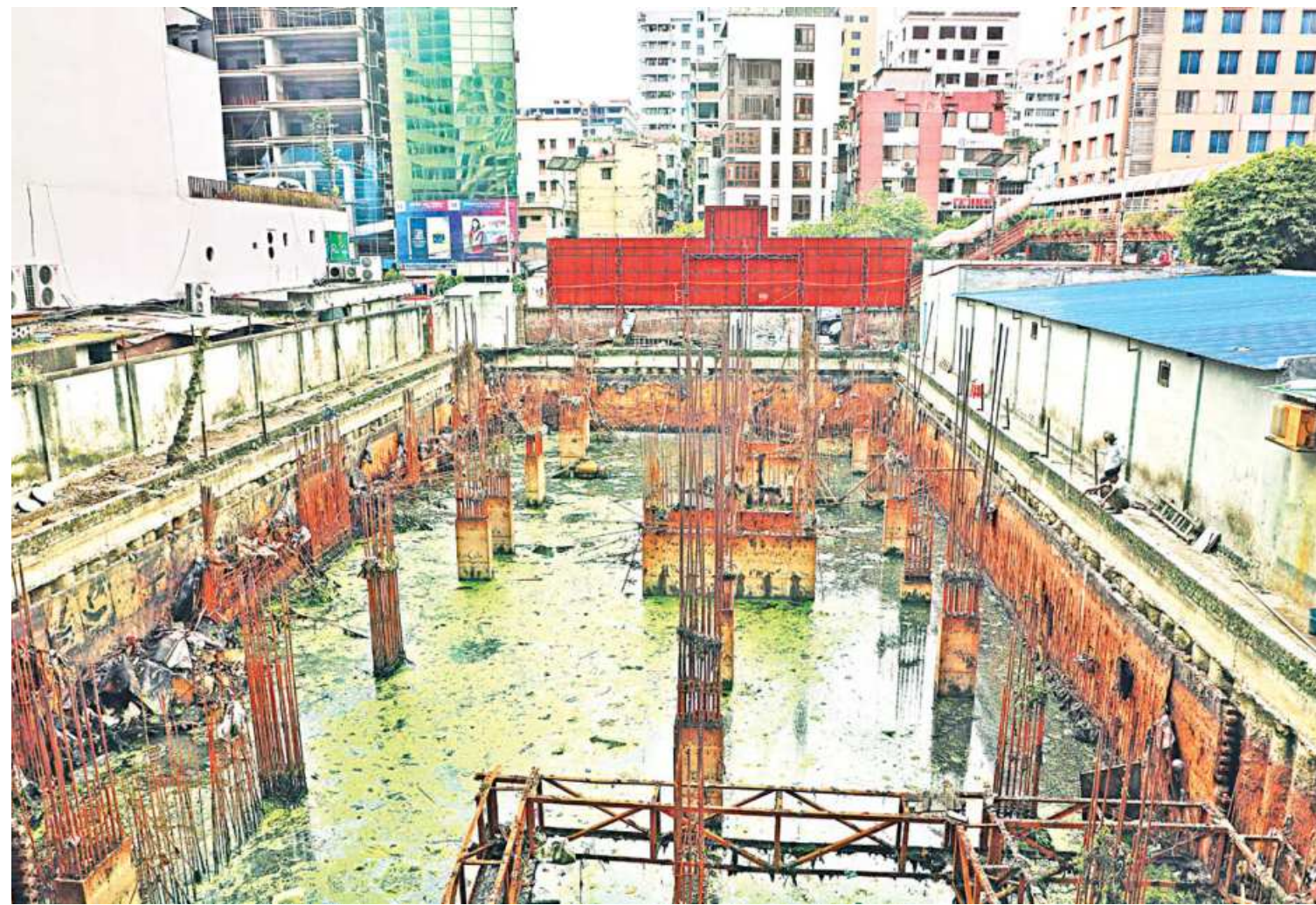
Stagnant water at a construction site, adjacent to Willes Little Flower School in Kakrail, can add to the number of dengue cases in the capital. Experts have warned that schools and their surrounding areas must be cleaned before their reopening to reduce the risk of dengue spreading.