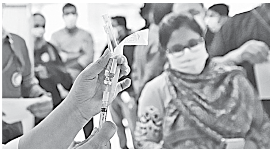
There are a huge number of older people and persons with comorbidities who have yet to receive a single dose of Covid vaccine.

Despite the limitations and uncertainties in the vaccine supply chain, the government is now contemplating inoculating adolescents aged 12-17 years (it had earlier lowered the bar for vaccination of students to 18). This comes