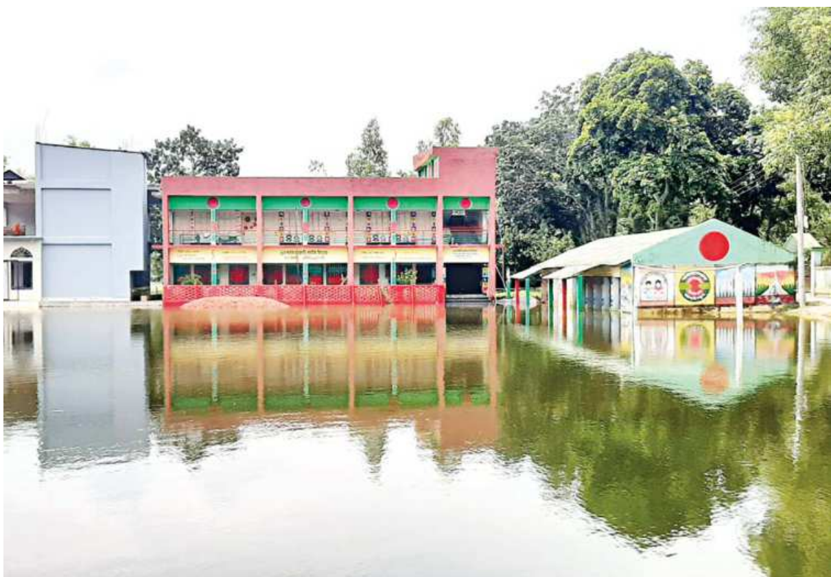
The playground and much of the lower levels of a government primary school in Gala union in Tangail Sadar remain under flood water. In view of Covid-19 infection rates going down, the government has directed that schools open in phases from September 12. However, flood-affected schools will not be opening on that day.