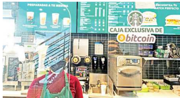
A sign reads: "Exclusive Bitcoin register" in a Starbucks store where the cryptocurrency is accepted as a payment method, in San Salvador, El Salvador on September 7.

"Bitcoin? No," one vendor cut a customer short. On social media,