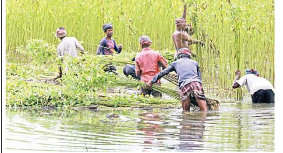
Farmers in Tangail expressed their satisfaction over the yield and the current market price of the fibre and jute sticks.

Local farmers had been supplied with good quality seeds this season after talking to the Bangladesh Agriculture Development Corporation and private seed traders, he said.