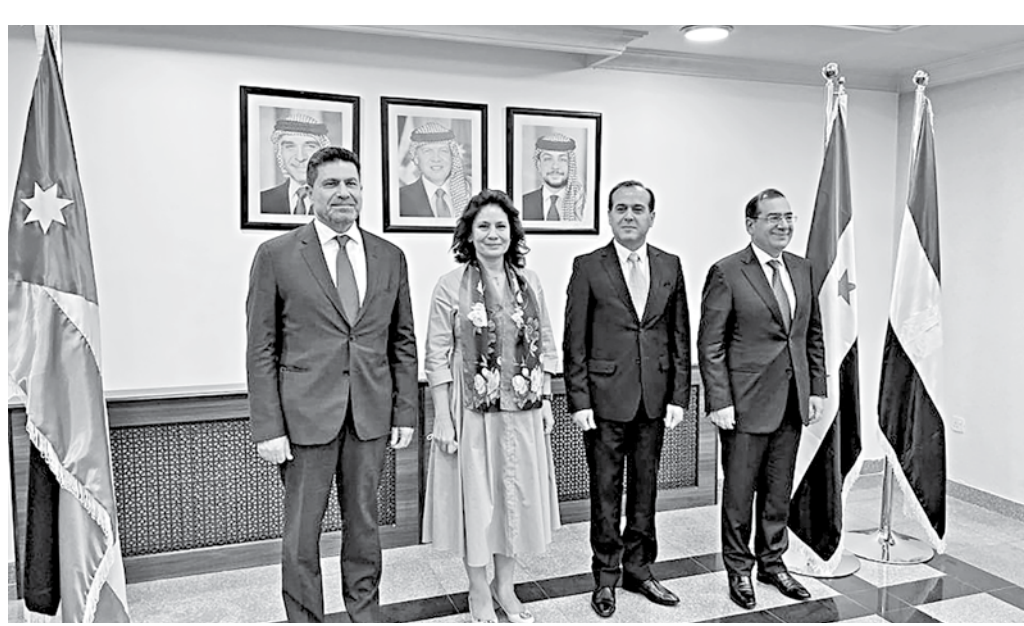
Lebanon's Energy Minister Raymond Ghajar, Jordan's Minister of Energy and Mineral Resources Hala Zawati, Syria's Minister of Oil and Mineral Resources Bassam Tohme and Egypt's Minister of Petroleum and Mineral Resources Tarek El Molla meet in Amman, Jordan on September 8.

REUTERS, Amman The Lebanese government said on Wednesday it was working with the World Bank to secure financing for a plan to import Egyptian gas via Jordan and Syria to generate power for Lebanon, which is struggling with an economic crisis and acute power shortages. Lebanese caretaker Energy Minister Raymond Ghajar was speaking at a news conference after meeting his Jordanian, Syrian and Egyptian counterparts in Amman to discuss the plan to reduce power outages in Lebanon. Daily life has been paralyzed in Lebanon by the power crisis that is part of the country's wider economic meltdown. The state-owned power company is generating only minimal amounts of power, leaving businesses and households almost entirely dependent on small, privately-owned generators. Industry experts put Lebanon's peak power demand at 3,500 MW. The country has installed capacity, including power barges it rents, to generate about 2,200 MW - but the output is well below these levels. Egypt's petroleum minister Tarek El Molla said he hoped Egyptian gas would be exported as soon as possible.