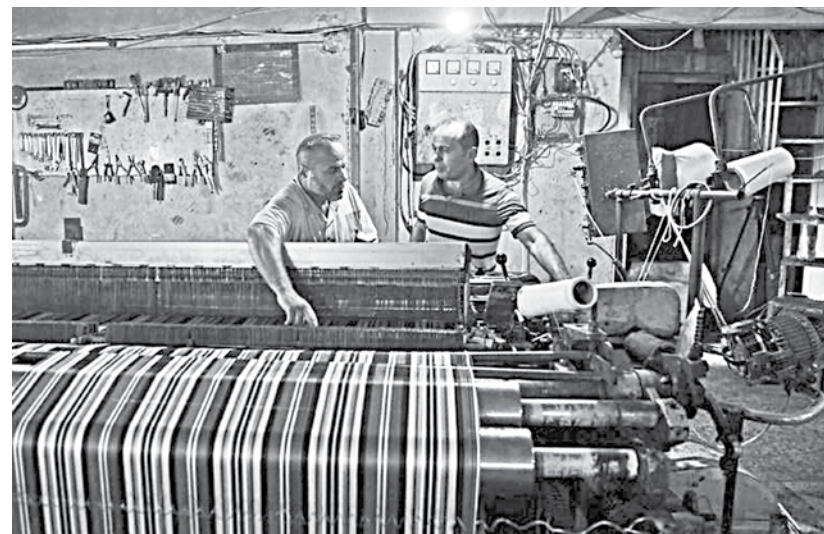
Syrian men work at a workshop in Aleppo. Syrians in government-held areas have had to adapt their lives at home and work around power cuts of up to 20 hours a day.

But instead, "we're dicing with death". In industrial areas of the northern city, the state is supposed to provide power from 6:00 am to 6:00 pm four days a week, though in practice even that supply is often punctuated by electricity cuts. Outside these hours, the public network runs dead. Businessmen who can afford it buy diesel fuel to operate private generators, but many more are forced to shut up shop.