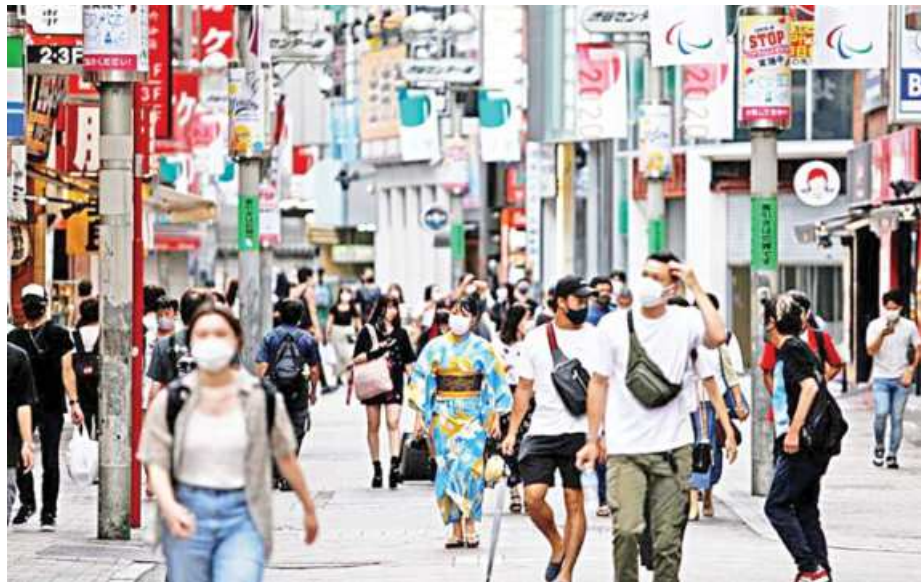
People walk in Shibuya shopping area during a state of emergency amid the coronavirus disease outbreak in Tokyo, Japan on August 29.

Still, Japan's economic recovery remains fragile due to slow Covid-19 vaccinations and as pandemic restrictions hamper private-sector activity.