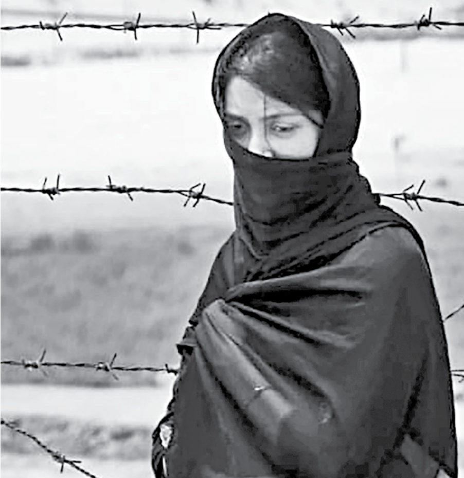
We need proactive action—not reactive—to prevent human trafficking in Bangladesh.

Trafficking is, unfortunately, not a new phenomenon in Bangladesh. Data suggests that around 400 women are trafficked out