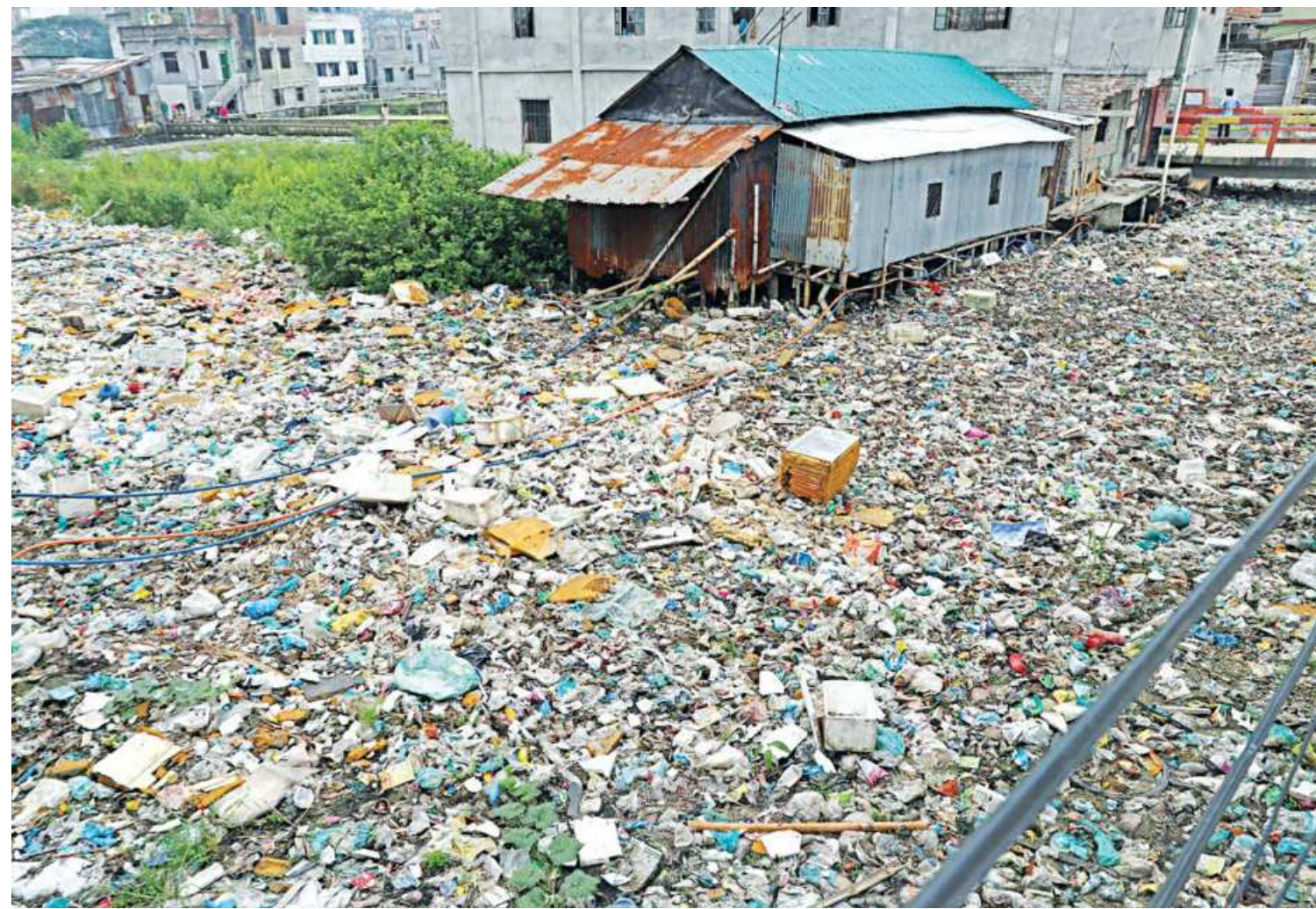
The Bijoy Nagar canal in the capital's Madina Mugdapara is blocked completely by trash mindlessly dumped by locals. The flow of water there has been disrupted due to obstruction by the heavy amount of garbage collected in it. The photo was taken yesterday.