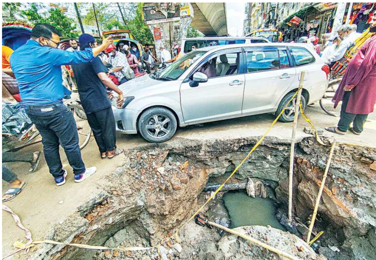
A car struggles to negotiate a road narrowed by a trench dug by the Dhaka South City Corporation for development work in the capital's AHM Kamruzzaman Sarani Banga Bazar. City dwellers have long been suffering due to this situation. The photo was taken yesterday.