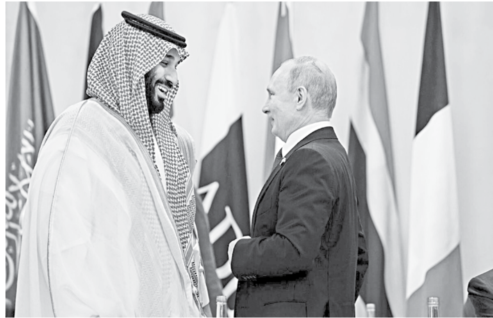
Saudi Arabia, a key US ally in the Middle East, recently signed a defence cooperation agreement with Russia.