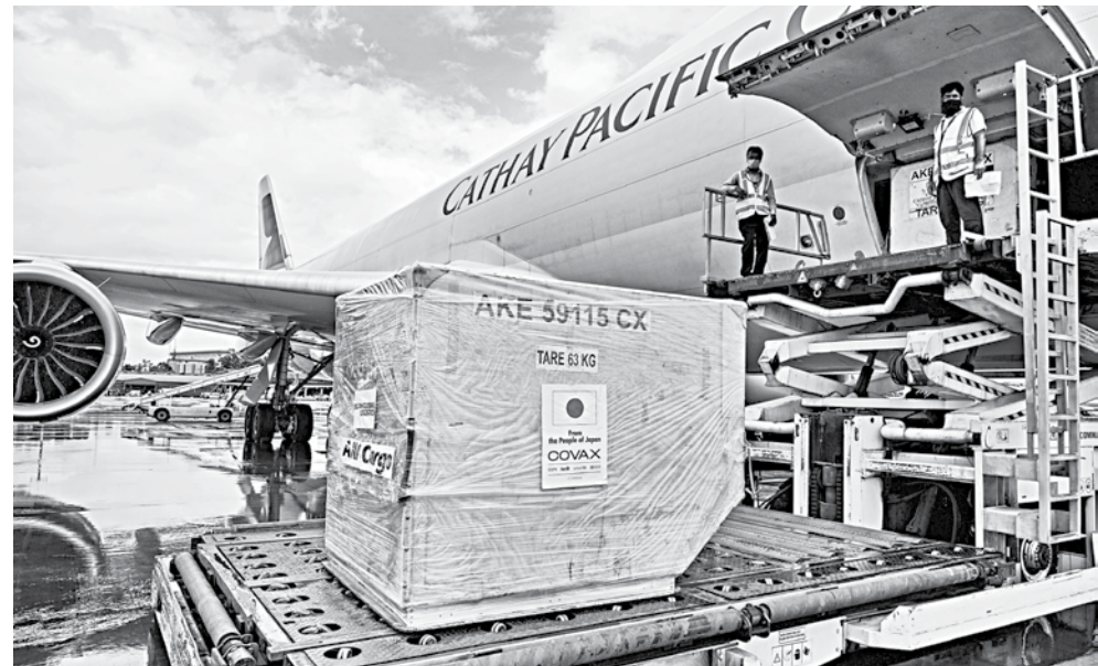
Bangladesh has received several consignments of Covid-19 vaccines via COVAX facility.

First, we need doses, and we need them now. The premise of COVAX was always that the facility should be able to negotiate and