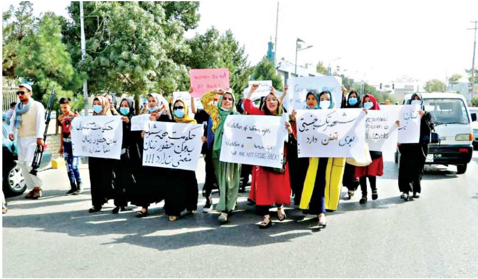
Women gather to demand their rights under the Taliban rule during a protest in Mazar-e-Sharif, Afghanistan yesterday. In a lengthy document issued by the Taliban's education authority on Sunday, the Islamist group ordered that women attending private Afghan universities must wear an abaya robe and niqab covering most of the face, and classes must be segregated by sex -- or at least divided by a curtain.