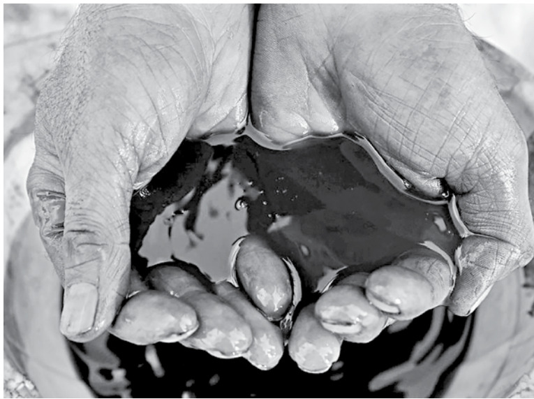
An employee holds a sample of crude oil at the Yarakta oilfield, owned by Irkutsk Oil Co, in the Irkutsk region, Russia.

State oil giant Saudi Aramco lowered for the first time in four months the official selling price (OSP) of Arab Light crude for delivery to Asia in October to a premium of $1.70 per barrel versus the average of DME Oman and Platts Dubai crudes, according to a company pricing document. The