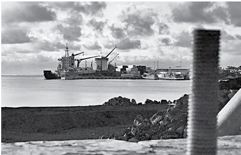
A container ship unloads at the Matakau port, which has been expanded through support from Japan, in the Samoan capital of Apia.

An IMO-driven carbon levy will enable more industry input at the global level as concerns grow at regulation by separate jurisdictions such as the EU.