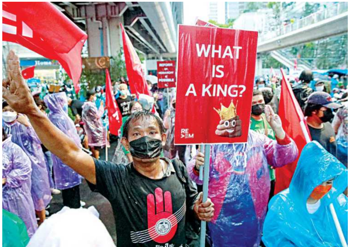
Demonstrators take part in a protest over the Thai government's handling of the coronavirus disease (COVID-19) pandemic and to demand Prime Minister Prayuth Chan-ocha's resignation, in Bangkok, Thailand, yesterday.

US President Joe Biden on Friday ordered declassification over the next six months of still secret documents from the government investigation into the 9/11 terrorist attacks. Biden is responding to pressure from families of some of the approximately 3,000 people killed by Al-Qaeda on September 11, 2001. They have long argued that the classified documents might contain evidence that the government of Saudi Arabia, a close US ally, had links to the hijackers who flew into the World Trade Center and Pentagon.