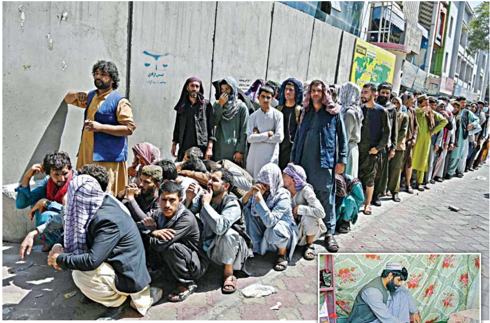
People stand on a queue outside a bank to withdraw money at Shar-e-Naw neighborhood in Kabul, yesterday. Inset, An Afghan vendor prepares weapons and ammunition to display for sale while waiting for customers in his shop at a market in Panjwai district of Kandahar province yesterday.