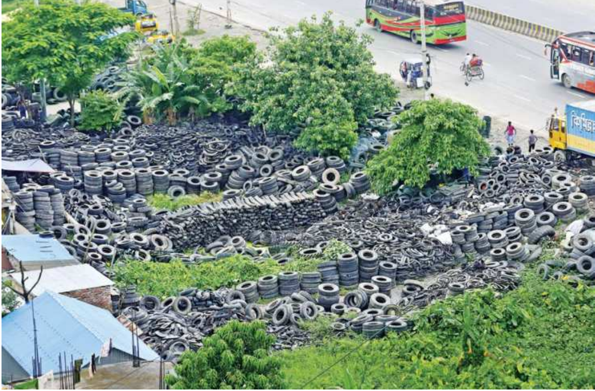
Worn tires waiting to be retreaded are left on what used to be a canal by the Dhaka-Chattogram highway in Sanarpar. Nearby neighbourhoods get inundated almost every monsoon, partly because of such occupation of drainage systems.

Once the pandemic is over, the crest will be delivered to the recipients'