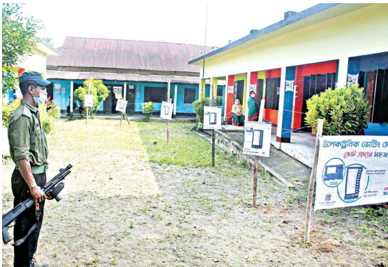
A security personnel stands guard at the polling centre of Ilashpur Government Primary School in Dakkhin Surma, Sylhet, yesterday during the by-polls to Sylhet-3 constituency. The centre is mostly devoid of voters.