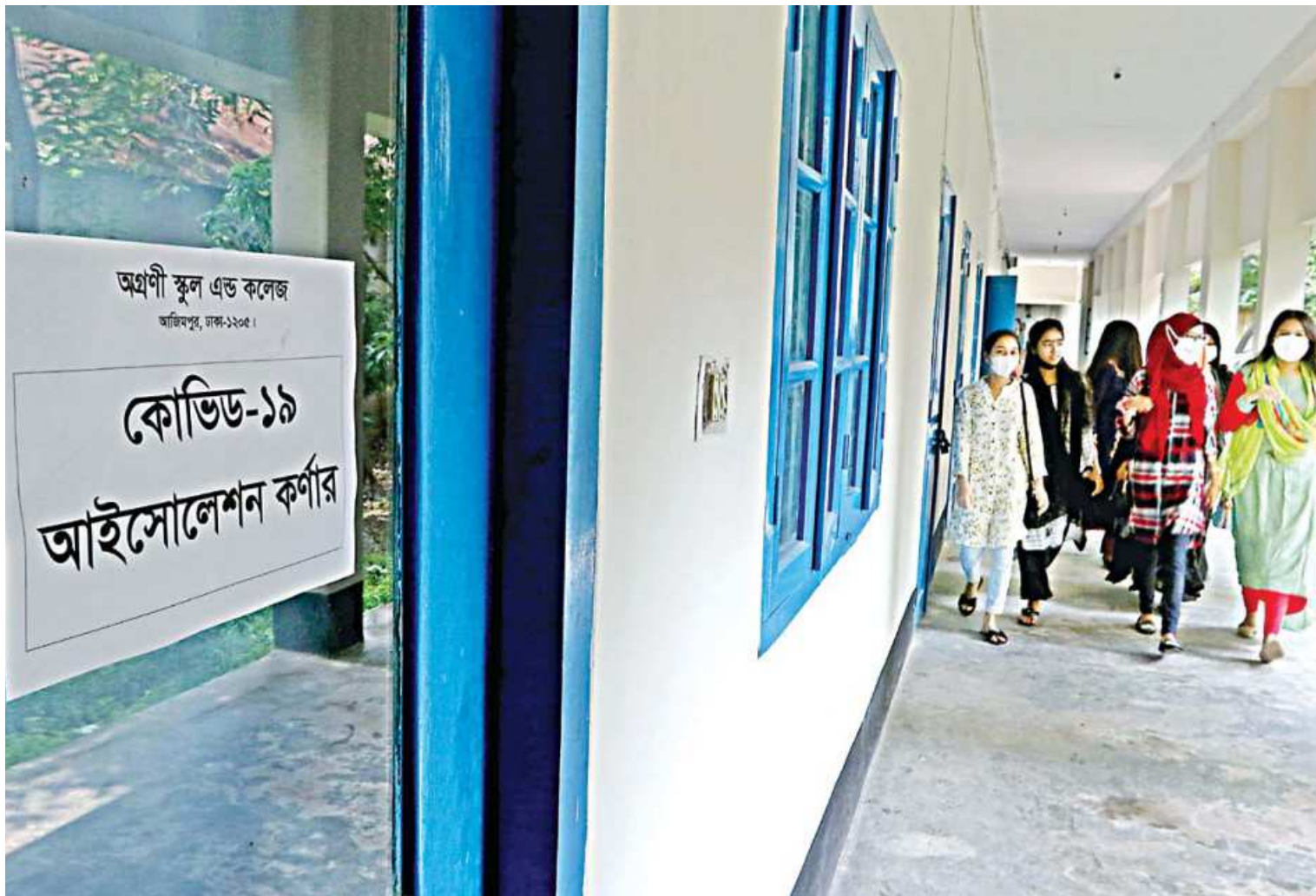
After almost one and a half years of online teaching amid coronavirus restrictions, schools are making preparations to have the children in the classrooms as the government announced that students will attend classes from September 12. Agrani School and College in the capital's Azimpur, pictured here, also arranged an isolation corner in case anyone falls sick while at school.