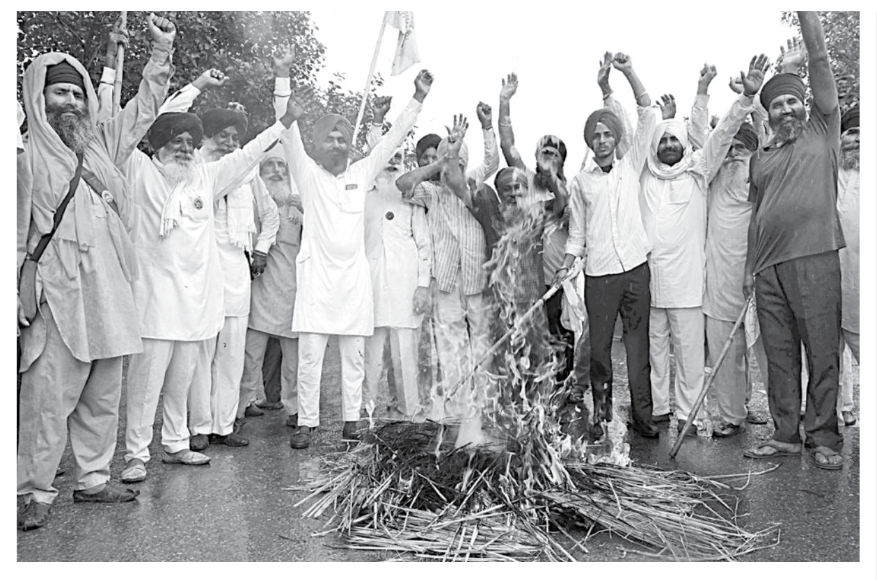
Farmers shout slogans as they burn an effigy of Punjab and Haryana chief ministers during a demonstration against the central government's agricultural reforms, on the outskirts of Amritsar, India yesterday.

In case of providing security to Bangabandhu's family members, this new act will be given priority no matter whatever is there in Father of the Nation Bangabandhu Sheikh Mujibur Rahman's Family Members Security Act-2009.