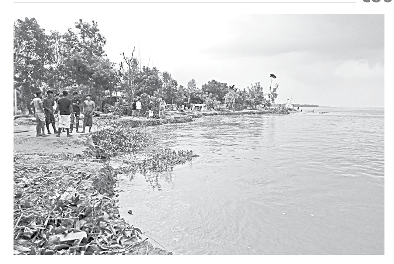
Erosion by the Jamuna river has already devoured almost 70 percent area of Jalalpur village in Sirajganj's Shahzadpur upazila.