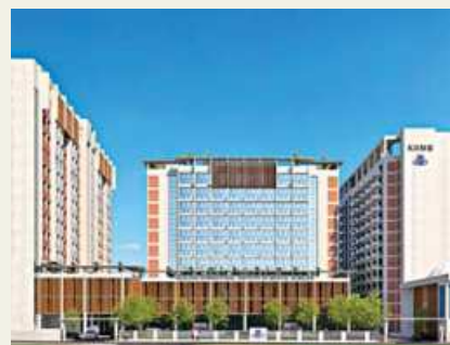
Since May last year, Kumudini Hospital in Tangail has been providing free treatment for all Covid-19 patients. Inset, the hospital's parent organisation is aiming to build a global-standard medical research centre and hospital -- Kumudini International Institute of Medical Sciences and Cancer Research -- in Narayanganj.