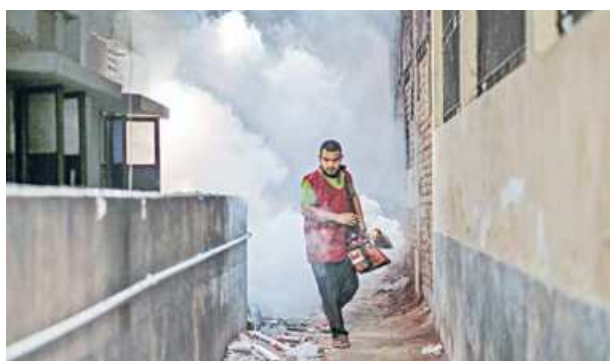
Jurain regularly wears a dawn-like atmosphere in the afternoon these days. As one of the neighbourhoods hit hardest by dengue, its streets are being fogged heavily by DSCC staffers. However, locals said this tenacity was missing even a week ago, suspecting the continued rise in dengue cases to have set some alarms off for the city authorities. These photos were taken on Tuesday.