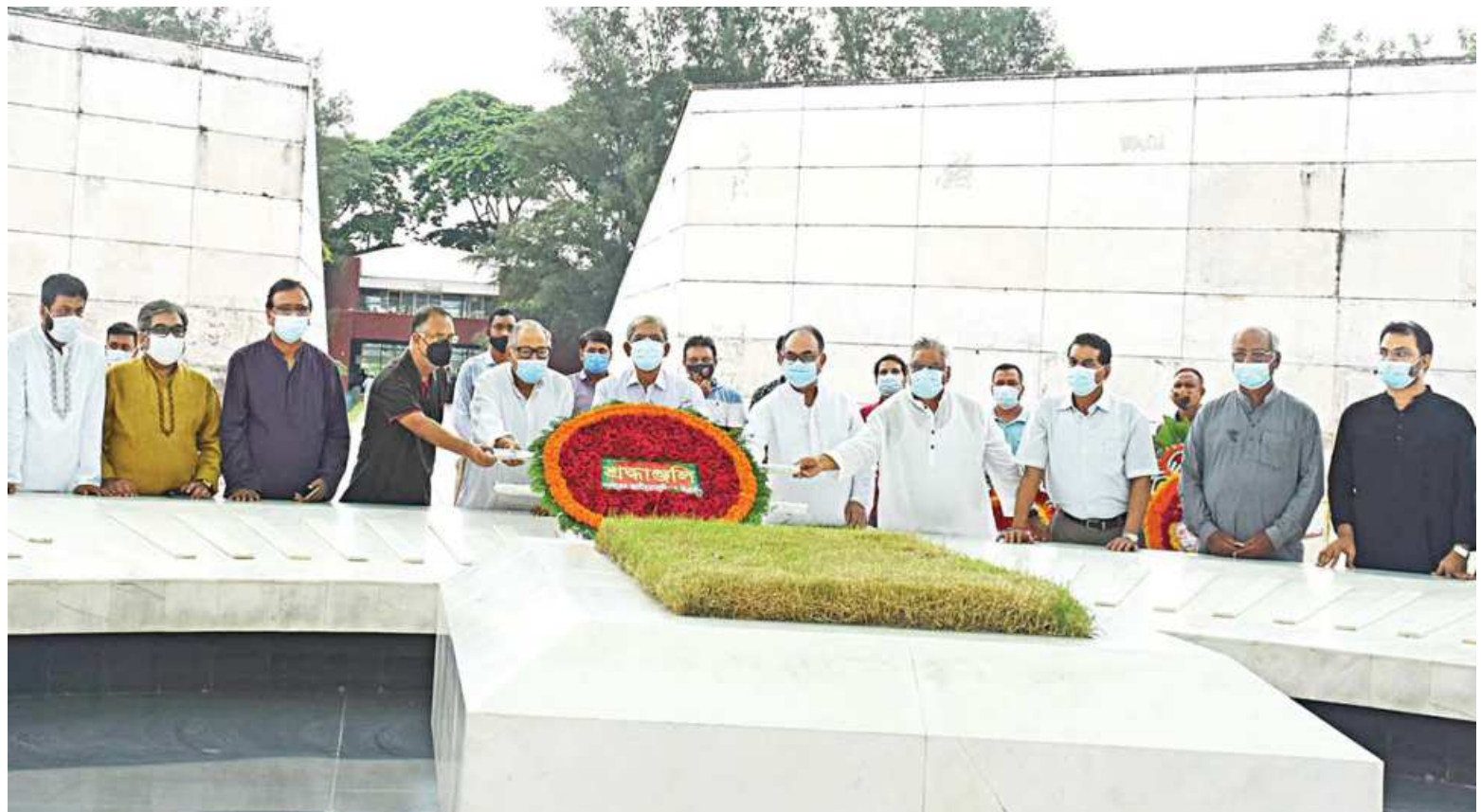
BNP secretary general Mirza Fakhrul Islam Alamgir along with party leaders placed a floral wreath at the party founder Ziaur Rahman's grave in the capital's Chandrima Udyan yesterday, marking its 43rd founding anniversary.