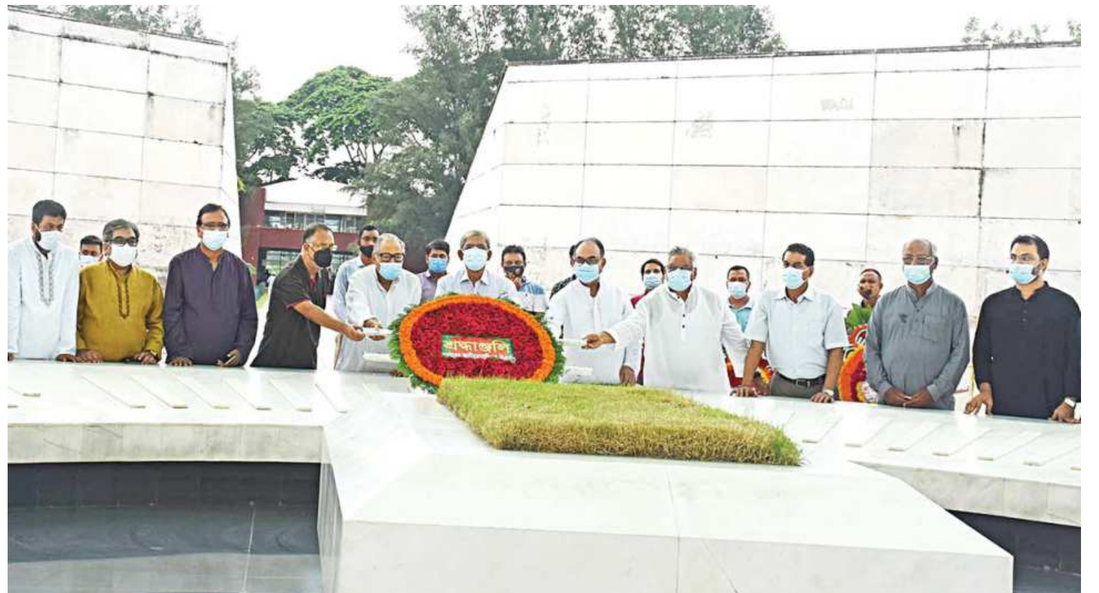
BNP secretary general Mirza Fakhrul Islam Alamgir along with party leaders placed a floral wreath at the party founder Ziaur Rahman's grave in the capital's Chandrima Udyan yesterday, marking its 43rd founding anniversary.