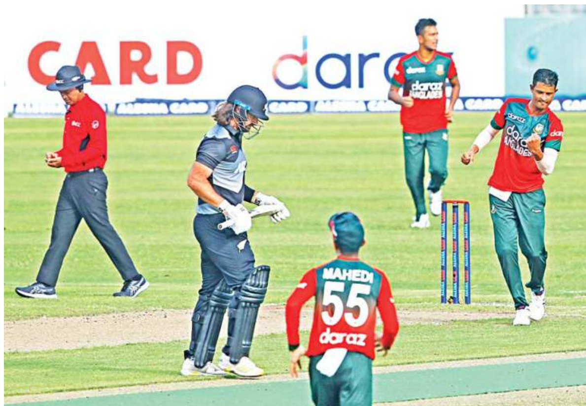
Bangladesh spinner Nasum Ahmed, right, clenches his fist after dismissing New Zealand batsman Colin de Grandhomme, 2nd from left, during the first T20I at the Sher-e-Bangla National Stadium in Mirpur yesterday.