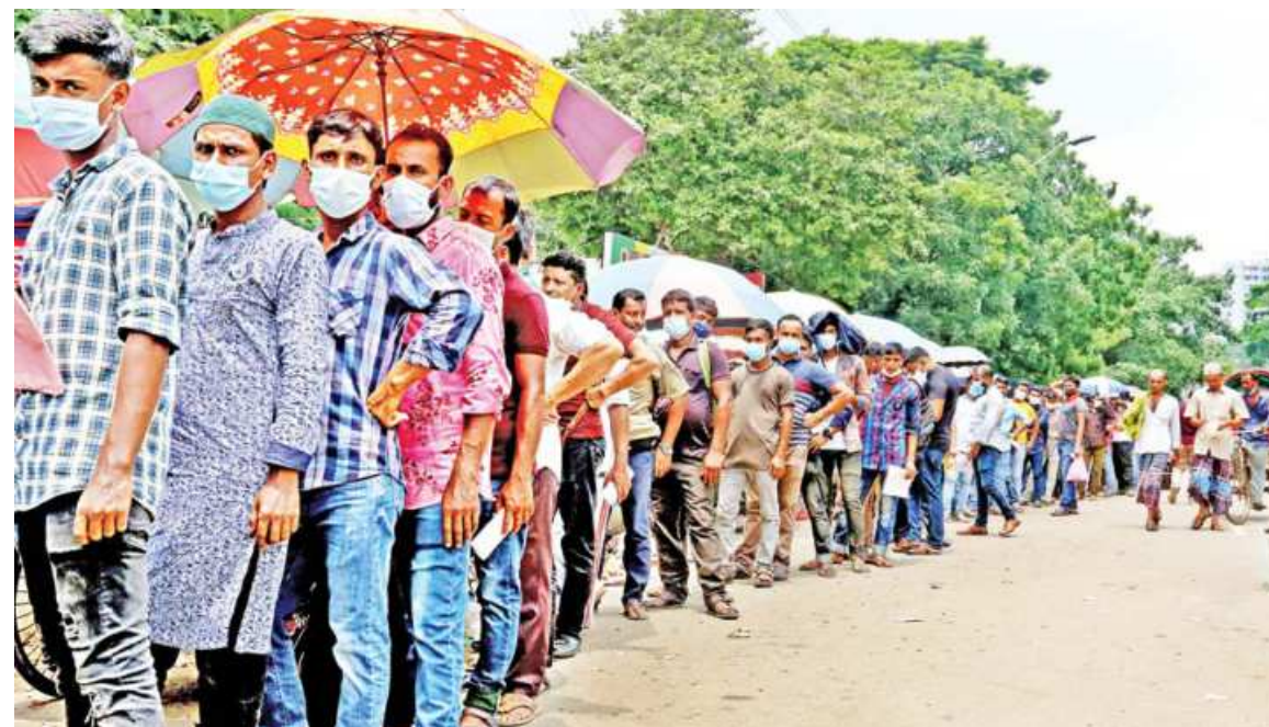
Migrant workers stand in a queue for taking vaccines on the premises of Dhaka Medical College and Hospital. Remittances sent by migrant workers play a major role in strengthening the country's foreign exchange reserves.

Inward remittance hit its highest point of around $25 billion in