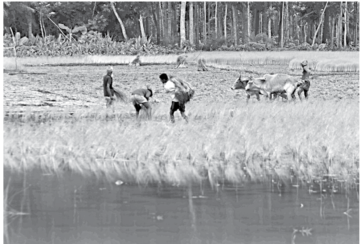
Farmers in Pirojpur's Indurkani upazila are seen busy planning Aman seedlings.