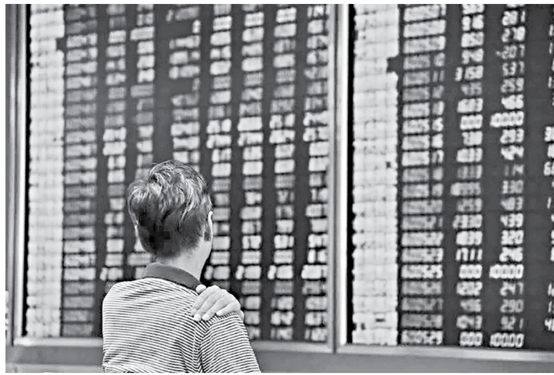
An investor looks at an electronic board at a brokerage house in Beijing.

Oil prices dipped as investors assess the damage to refineries after Hurricane Ida slammed into the Gulf of Mexico, while they are also awaiting the monthly meeting of OPEC and other key producers on Wednesday.