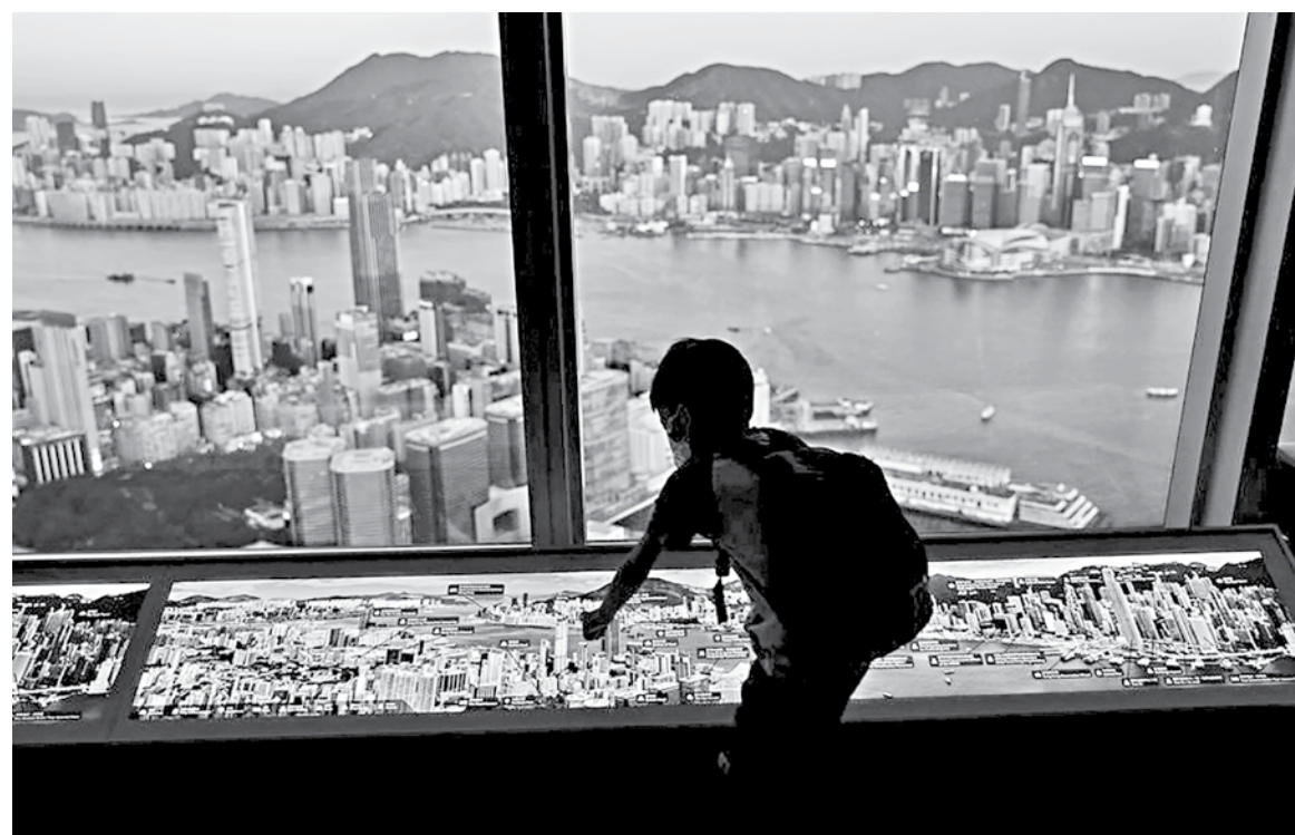
A child plays in front of skyline buildings in Hong Kong, China on July 13.

It aims to expand to between 60 and 70 planes in 2022.