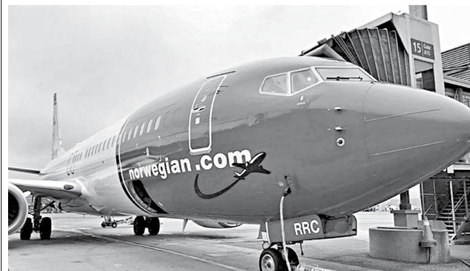
Norwegian Air hopeful of travel rebound but keeps cautious stance.