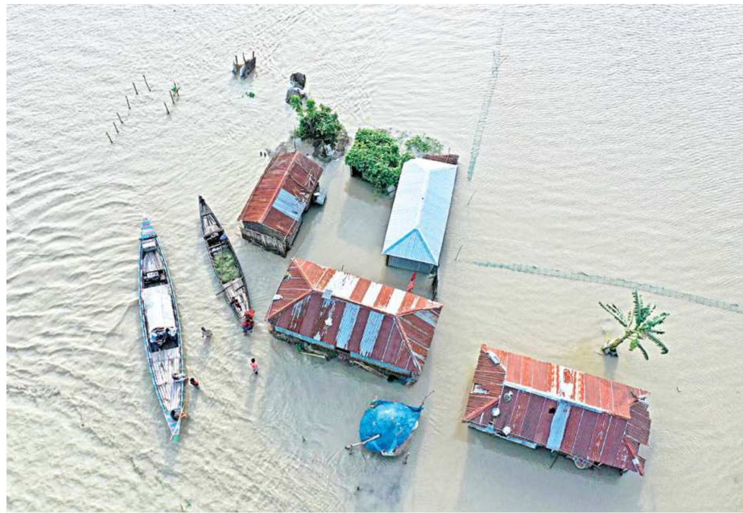
Aerial view of inundated Dolika Char in Bogura's Sariakandi upazila. Many such places of the district have remained flooded for around two weeks after the Jamuna swelled due to the rush of water from the upstream. Many locals have moved their homes and use boats to go to one place from another. The photo was taken yesterday.