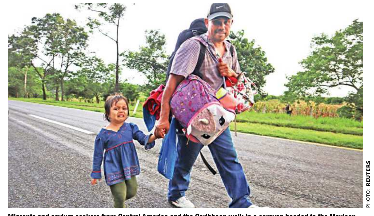
Migrants and asylum seekers from Central America and the Caribbean walk in a caravan headed to the Mexican capital to apply for asylum and refugee status, on a highway near Escuintla, in Chiapas state, Mexico on Sunday.

2005 - About 1,000 Iraqi Shias died in a stampede over a Tigris River bridge in Baghdad, panicked by rumours that a suicide bomber was about to