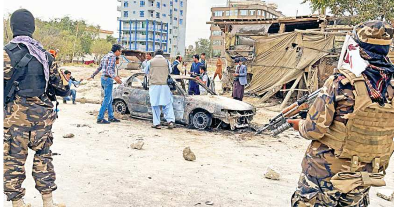
Afghan men take pictures of a vehicle from which rockets were fired, as Taliban forces stand guard, in Kabul, Afghanistan yesterday.

But any renewed movement on the issue could shake the foundations of Bennett's government of left-wing, rightist, centrist and Arab parties that in June ended Benjamin Netanyahu's 12-year run as prime minister.