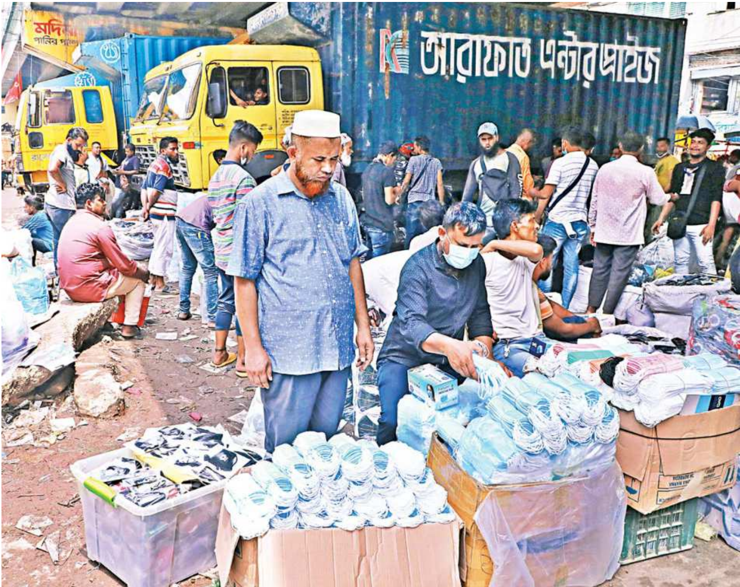
Under the Babu Bazar bridge near Mitford hospital, face masks are sold at wholesale rates of Tk 800-1,000 per 1,000 masks. Retailers, from hawkers to storeowners, come here to buy the masks in bulk and sell them for Tk 2-5 each. However, though helpful, these thin-layered masks don't protect against Covid-19 virus effectively. This photo was taken yesterday.