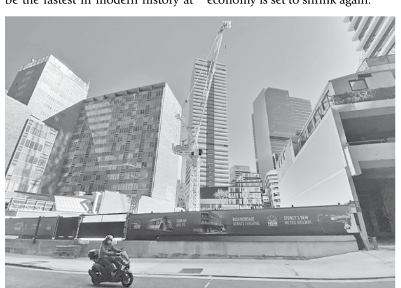
A view of a construction site for a train station on the Sydney Metro,

With a new round of lockdowns gripping millions in Sydney, Melbourne and Canberra the be the fastest in modern history at economy is set to shrink again.