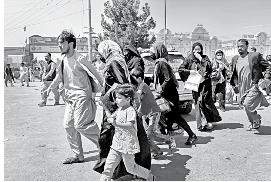
People try to get into Hamid Karzai International Airport in Kabul, Afghanistan, August 16, 2021.