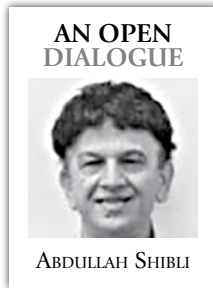
AN OPEN DIALOGUE