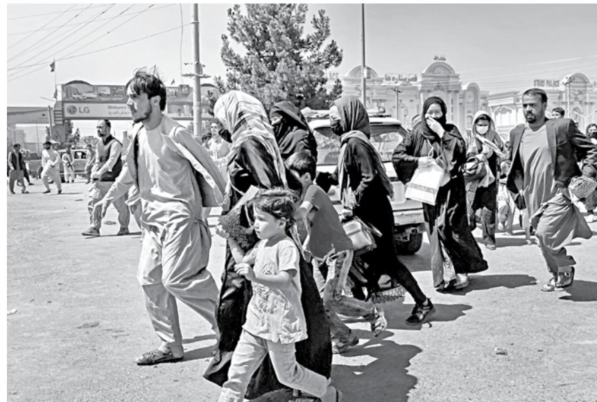
People try to get into Hamid Karzai International Airport in Kabul, Afghanistan, August 16, 2021.

in reserves, most of which is held by the New York Federal Reserve. Afghanistan was also slated to access about USD 450 million on August 23 from the IMF, which has effectively blocked the release of the funds because of a "lack of clarity" regarding the recognition of a new Afghan government. The new Taliban government has been advised by friends at home and abroad to come to a political