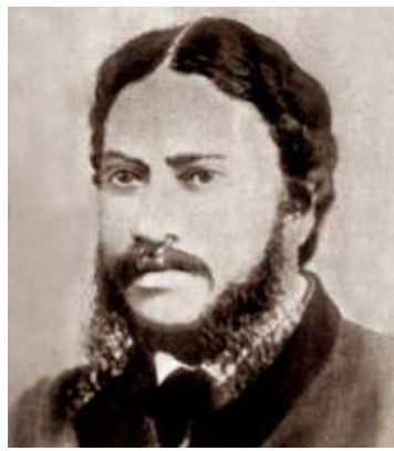
Michael Madhusudan Dutt (1824-1873) of Jessore