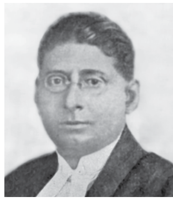
Deshpriya Jatindra Mohan Sengupta (1885-1933) of Chittagong