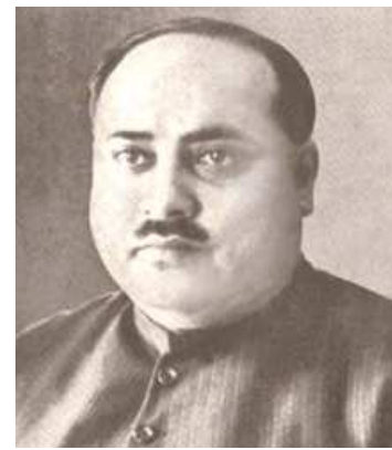
Khawaja Nazimuddin (1894-1964) of Dhaka.

Bengal, some Barristers with Hindu Bengali names as mentioned above from the Bengal presidency may have hailed from West Bengal, too. It was not possible to come by detailed information on them. Moreover, it is very intriguing to note that in the year 1880 alone nine Indians qualified as Barristers, a record number for a particular year of whom curiously seven were Muslims and only two Hindus. This is rather unique for the times and need further research to learn as to how so many Indian Muslims managed to qualify at the Bar in 1880, during the heyday of the Victorian era?