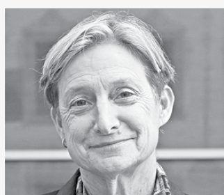
JUDITH BUTLER AMERICAN PHILOSOPHER (born February 24, 1956)

What is most important is to cease legislating for all lives what is liveable only for some, and similarly, to refrain from proscribing for all lives what is unliveable for some.