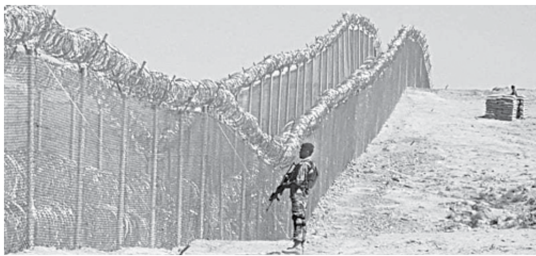
What is happening in Afghanistan has direct consequences for Pakistan as the two countries share a 2,500 km long porous border.

Though Pakistan has been working with US