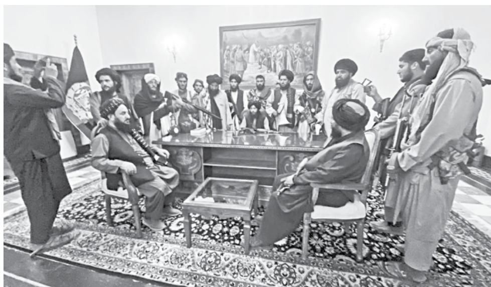
Taliban fighters inside the Afghan presidential palace.

ANN members comprise of The Korea Herald, China Daily, China Post (Taiwan), Gogo Mongolia, Yomiuri Shimbun and The Japan News, Dawn (Pakistan), The Statesman (India), The Island (Sri Lanka), Kuensel (Bhutan), Kathmandu Post (Nepal), The Daily Star (Bangladesh), Eleven Media (Myanmar), The Nation (Thailand), Jakarta Post, The Star and Sin Chew Daily (Malaysia), the Phnom Penh Post and Rasmei Kampuchea (Cambodia), The Borneo Bulletin (Brunei), The Straits Times (Singapore), Vietnam News, Philippine Daily Inquirer and Vientiane Times (Laos).