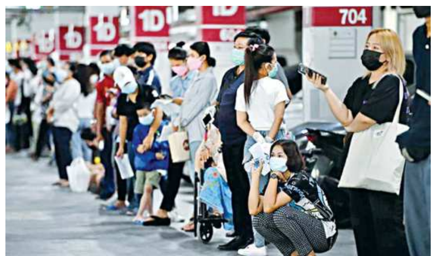
People queue for free coronavirus disease rapid antigen tests at a mass testing station, as the spread of Covid-19 continues, in Bangkok, Thailand on July 15.

"We need to adjust the way we handle and live with the disease safely... by adjusting strategy and build confidence so disease control measures are in line with reviving the economy safely," task force spokeswoman Apisamai Srirangsan told a briefing.