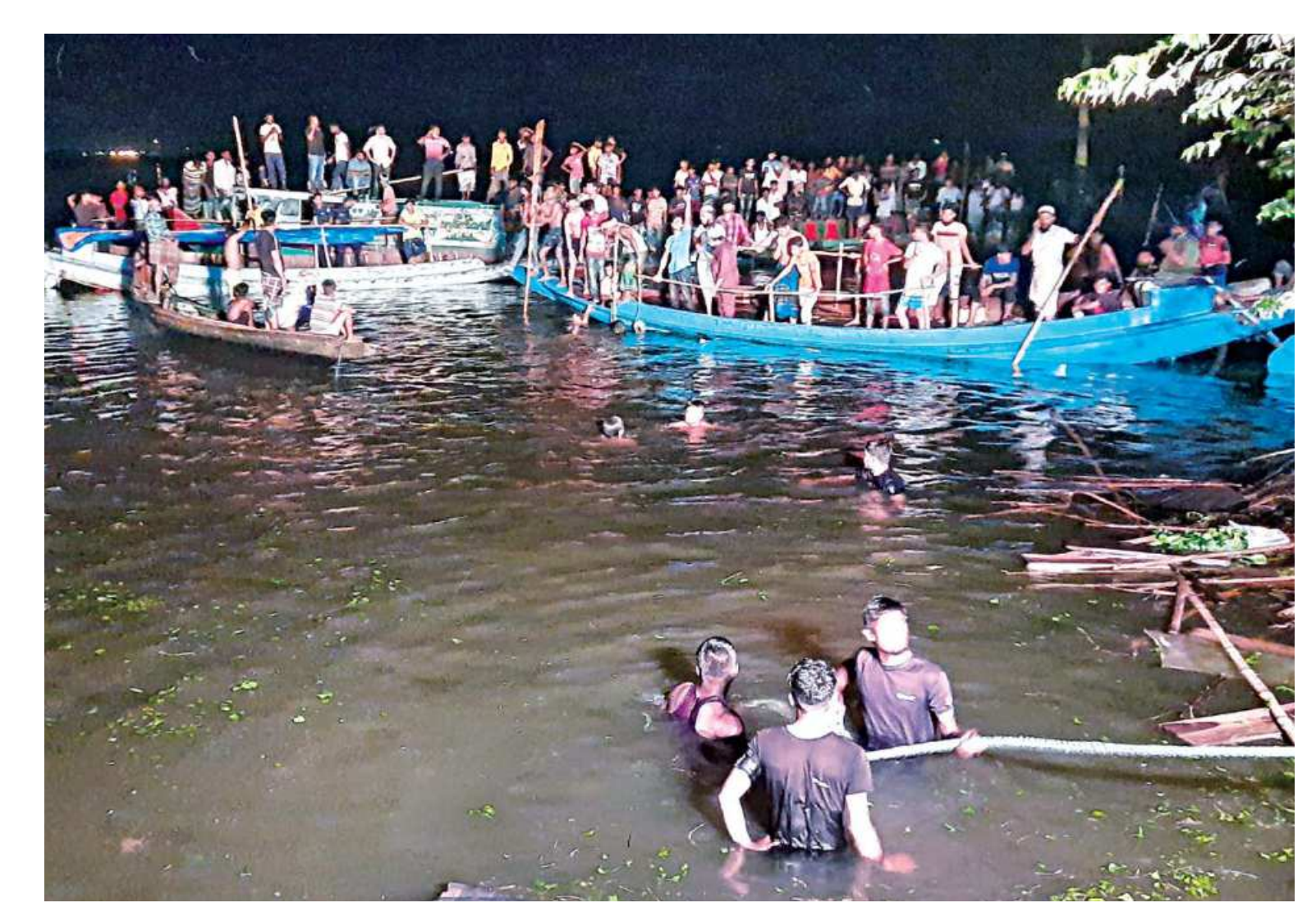
Locals looking for missing people after a boat capsized in Laishka Beel in Bijoynagar, Brahmanbaria, yesterday evening. At least 21 people died and about 50 others went missing after the boat sank.