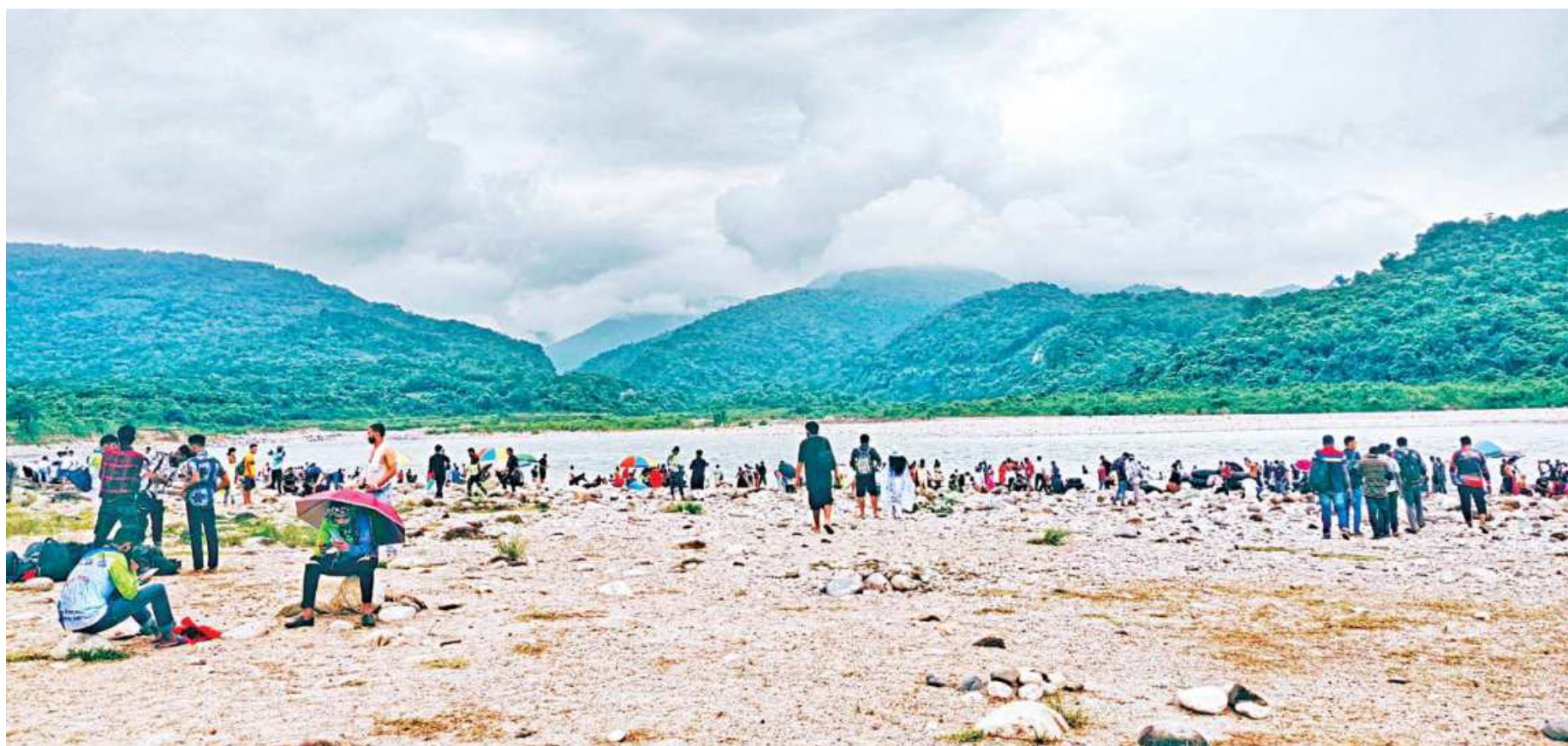
Tourists have started returning to the picturesque Shada Pathor in Sylhet's Companiganj upazila, bringing relief to associated income generating activities which had come to a standstill for the lockdowns. The photo was taken recently.

The BB purchased dollars worth $7.93 billion from local banks last year as part of its move to rein in the devaluation of the local currency.