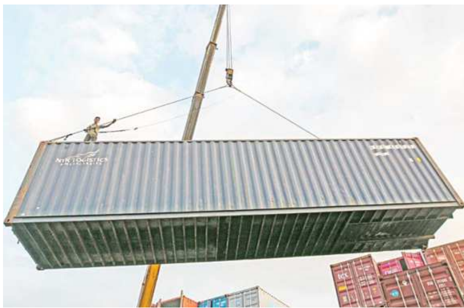
As the government amended the Customs Act 1989 to fix the minimum and maximum fines, import duty-related irregularities have gone down, putting a positive impact on revenue collection.

Customs sources say since there was no minimum fine, unscrupulous importers had gotten away with what could be considered a slap on the wrist for their actions over the past 50 years.