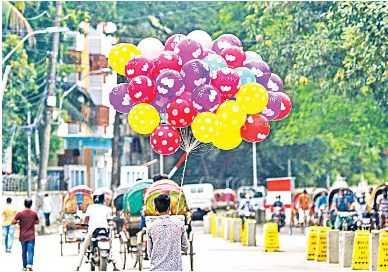
Dhaka University's TSC and its surrounding areas used to be a regular visiting spot for families. Parents would come in with their children, and buy them balloons and other toys they could find. But post-Covid, that very culture has gone missing. Failing to find customers, or an alternative means of earning, sellers of the area now roam around with their balloons, hoping they stumble upon customers on the way. This photo was taken yesterday.