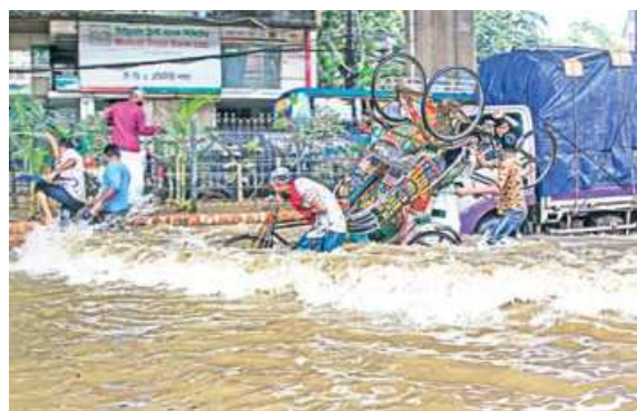
Yesterday's downpour was one of the worst for residents, as many had to deal with waist-deep water at multiple locations, including Gate-2 area, left, while firefighters were busy searching for a man who fell into a canal at Muradpur, as the pathway was submerged. He couldn't be found as of filing this report at 9pm.

this correspondent saw people living on the ground floor of buildings and in tin-roofed houses were bailing water out of their homes.