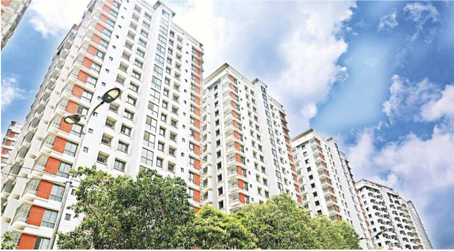
Demand for flats has gone up in Dhaka amid limited investment opportunities, a drastic fall in bank deposit rates, cheap loans, and the scope to legalise untaxed money without facing any question. The photo was taken recently.

DHAKA WEDNESDAY AUGUST 25, 2021, BHADRA 10, 1428 BS • starbusiness@thedailystar.net