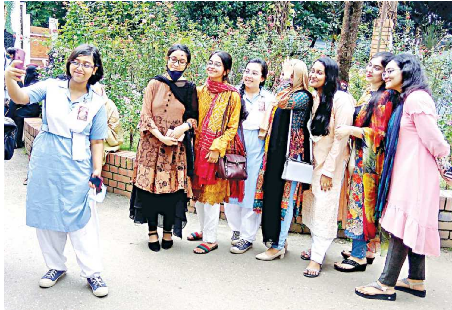
Students of Viqarunnisa Noon School and College take a happy selfie on their first day back on the Shiddeswari campus after a break of more than a year due to the Covid-19 pandemic. They radiated excitement as they went back to school to submit their recent assignments yesterday.