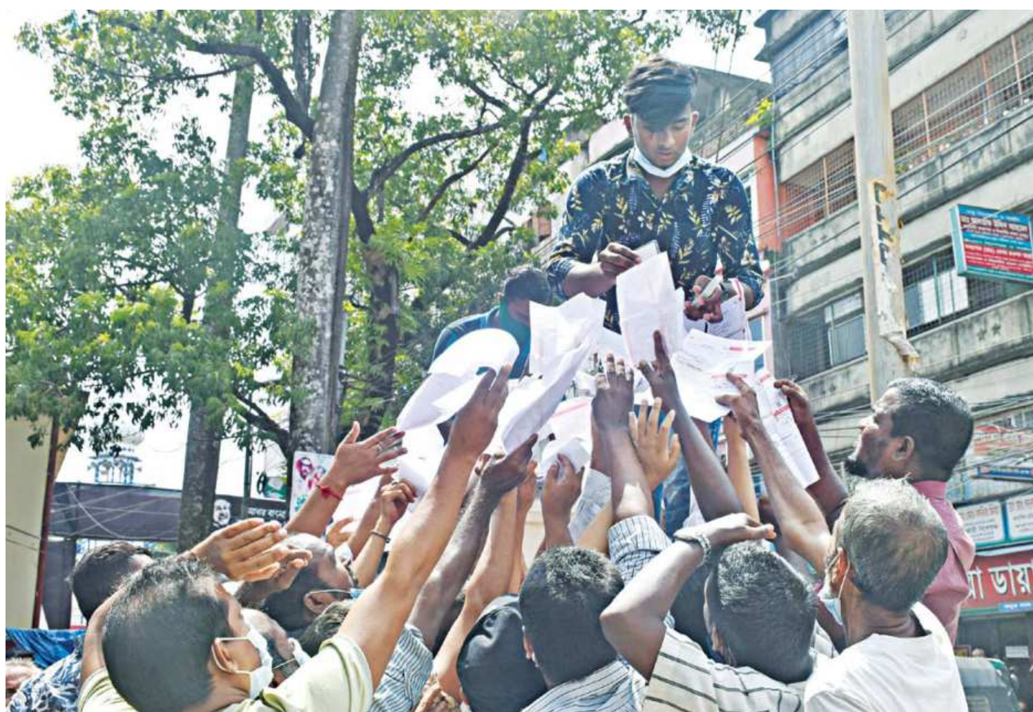
Scores of people surround an official of Barishal General Hospital, who is handing out tokens for the first dose of the Sinopharm vaccine. As only a 100 tokens were being handed out, people rushed to the hospital to collect theirs as soon as possible. The photo was taken yesterday.