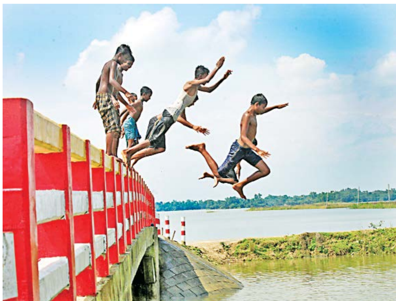
Taking full advantage of the care-free spirit of youth, these teens from Sylhet's Khadim Nagar union decided to take a dip into the water on a hot day, jumping right off a culvert's railings. This photo was taken on Sunday.