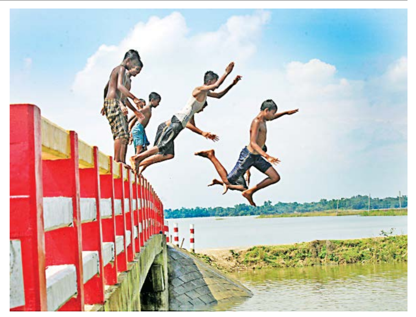
Taking full advantage of the care-free spirit of youth, these teens from Sylhet's Khadim Nagar union decided to take a dip into the water on a hot day, jumping right off a culvert's railings. This photo was taken on Sunday.