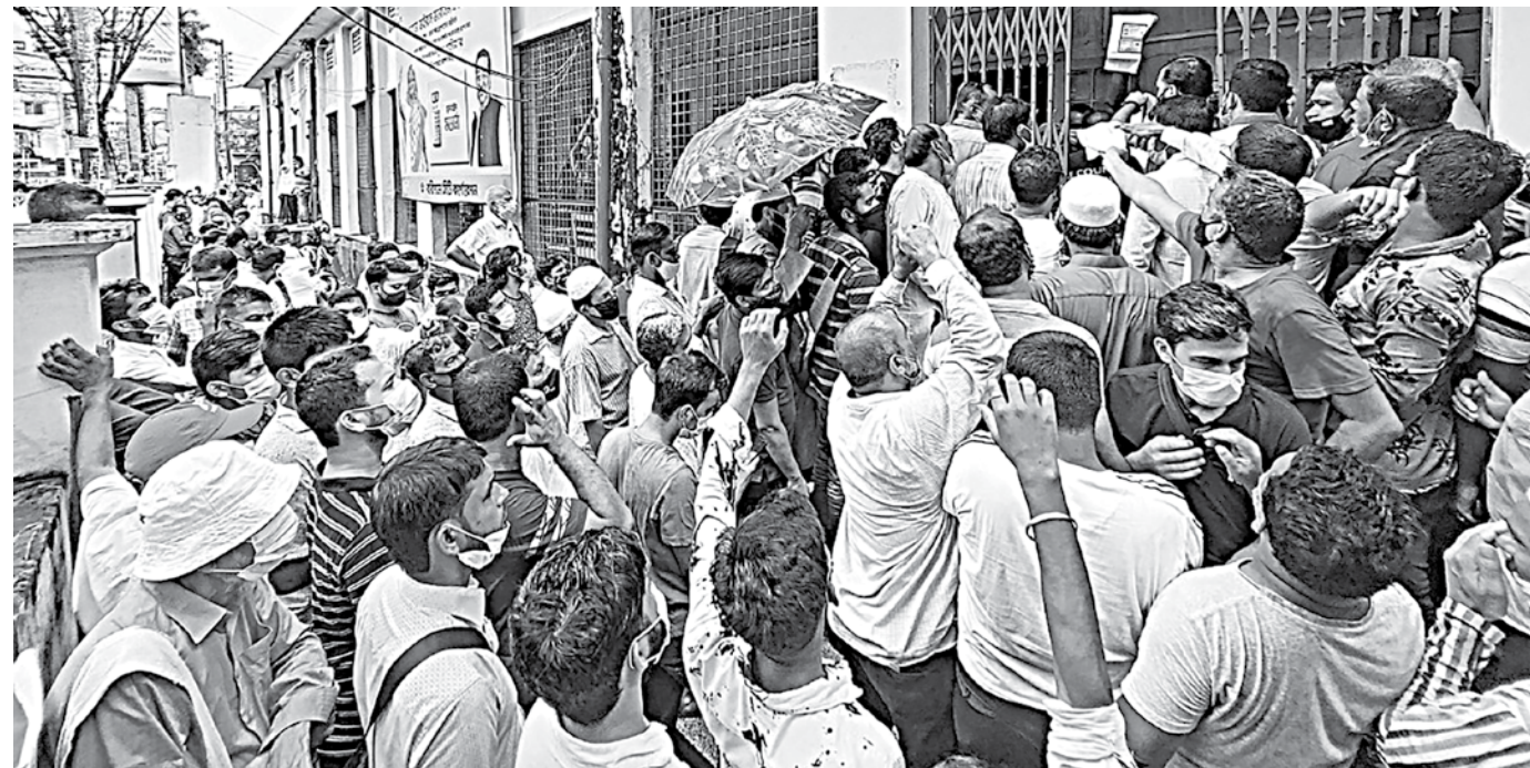
We can claim that 'the vaccination drive has been a complete success', even though there were pictures of physical skirmishing in some sites.

Lesson 4: Bangladeshis are some of the most psychologically delicate people in the world. While its law enforcement personnel are overworked and under-