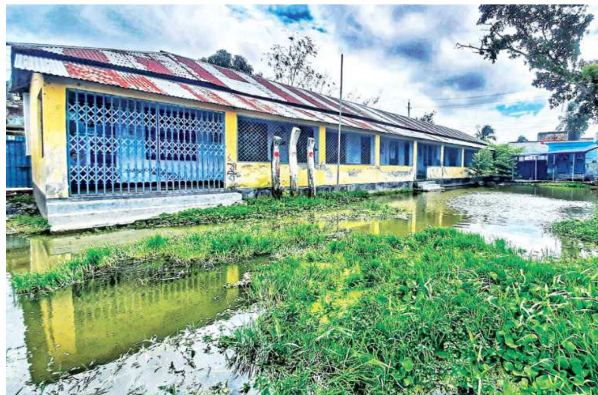
The closure of educational institutions amid the pandemic has left Bastuhara Government Primary School in Khulna city in an utterly sorry state. The front yard is waterlogged and there is vegetation on the Shaheed Minar.