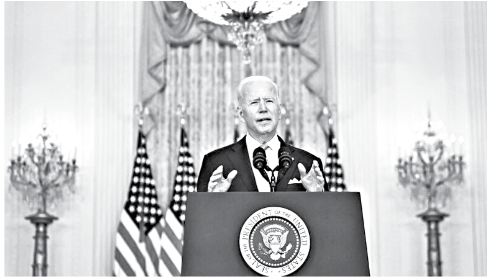
President Biden delivers remarks on August 16 about the situation in Afghanistan for the first time since the Taliban's takeover.