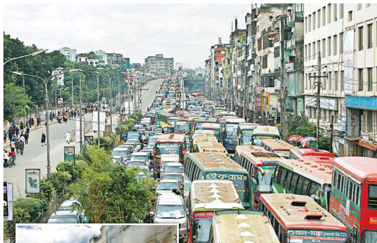
A fire at a building on Airport Road in the capital's Banani causes a gridlock on the key city street. City dwellers waited hours as traffic hardly moved on streets affected by the knock-on effect. Inset, members of fire service trying to douse the fire.