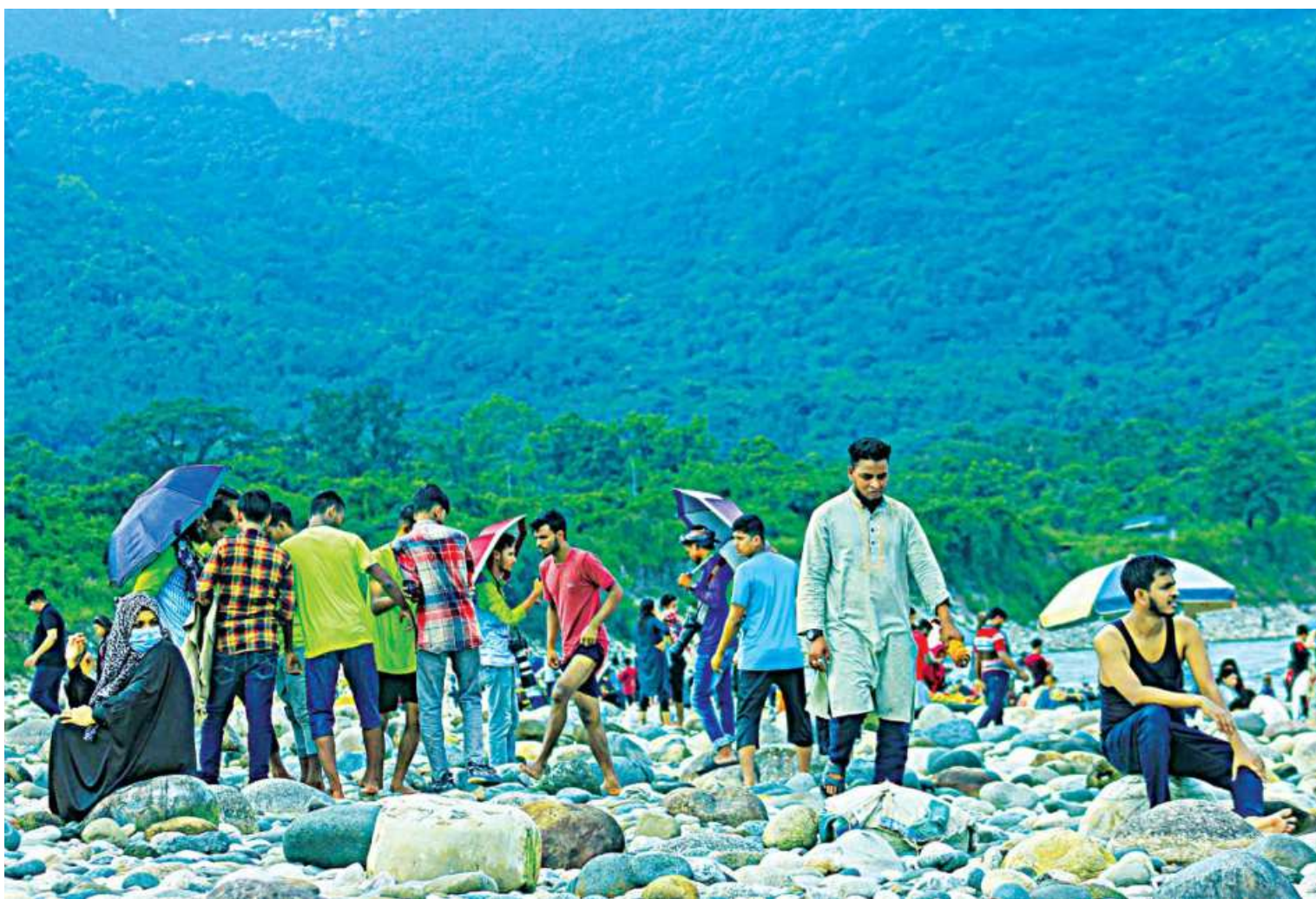
The scenic Shada Pathor area in Companiganj, Sylhet, has started to see tourists after a long time. Coronavirus restrictions have put many, whose livelihood depends on the tourists, out of business. Many of the tourists, however, were not maintaining social distancing or wearing masks.