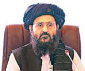
Mullah Abdul Ghani Baradar