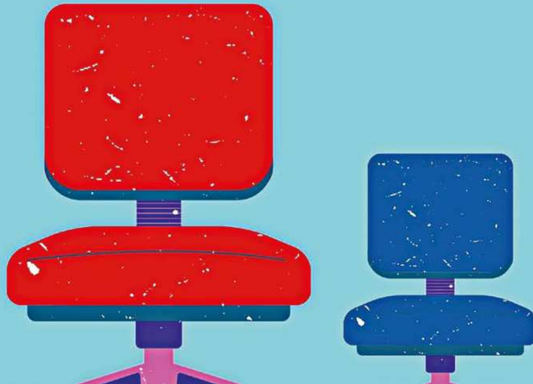
ILLUSTRATION: ZARIF FAIAZ