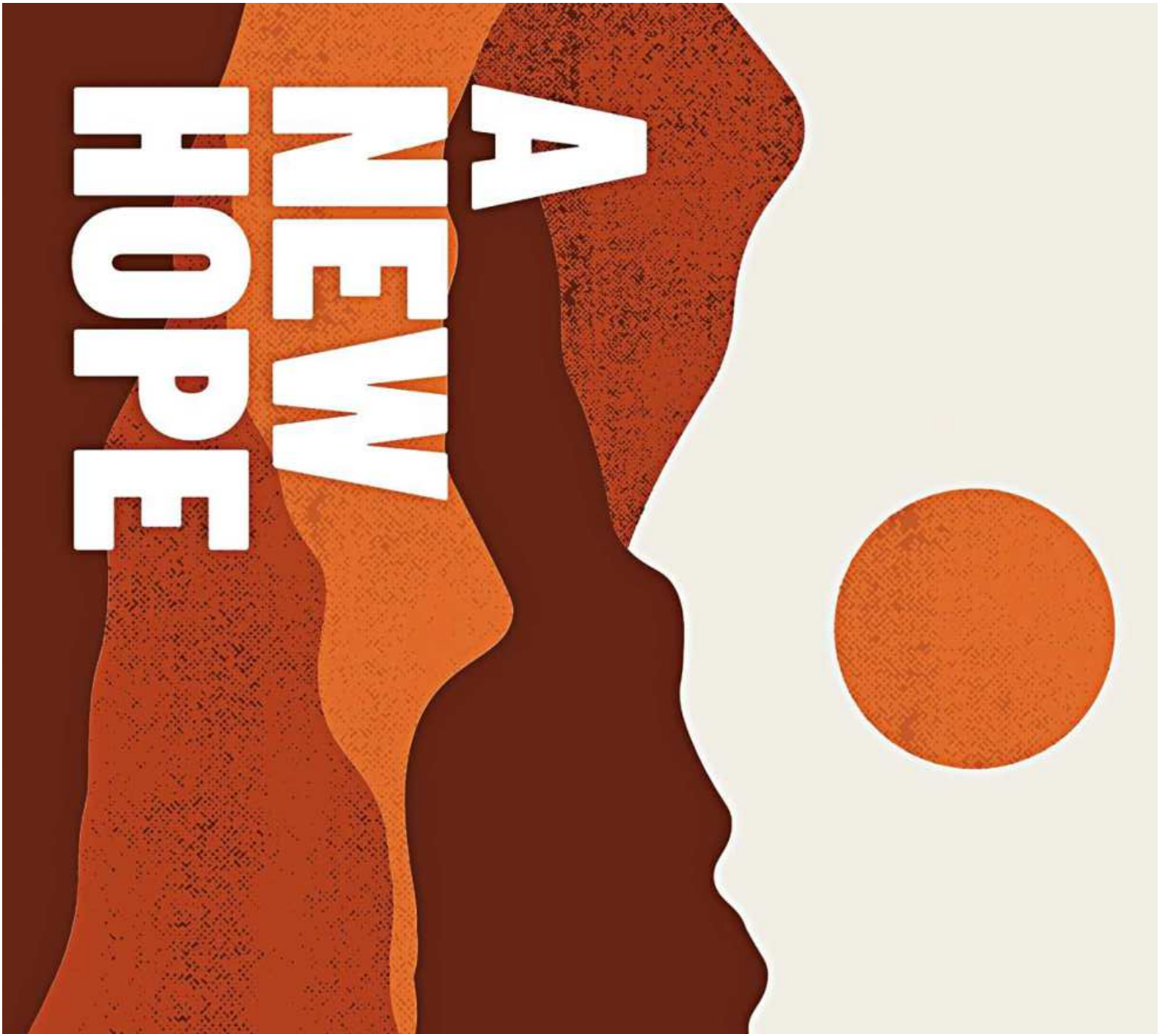
ILLUSTRATION: ZARIF FAIAZ